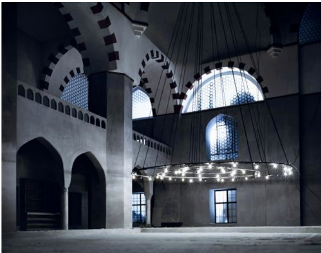
Mosque (after Sinan) #2, 2006