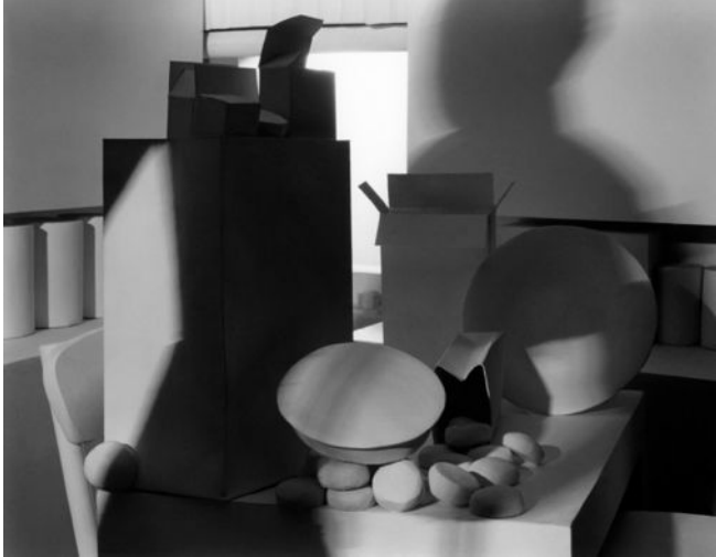
Kitchen Table, 1982