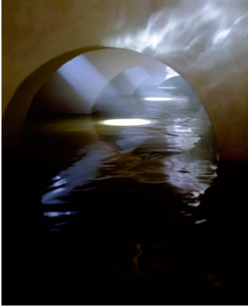
Four Flooded Arches from Right with Fog, 1999