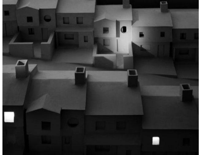
Subdivision with Spotlight, 1982