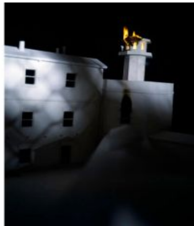
Prison at Cherry Hill on Fire, 1992