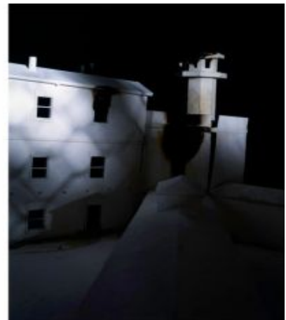
Prison at Cherry Hill Burnt, 1992