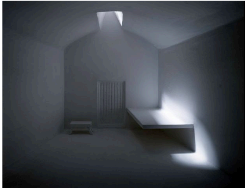
Prison Cell with Skylight, 1993