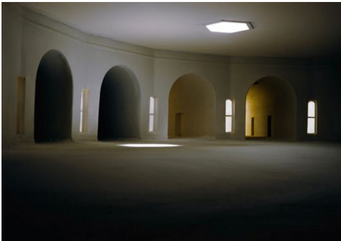
Converging Hallways from Left, 1997