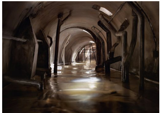
Bologna Tunnel #5, 2010