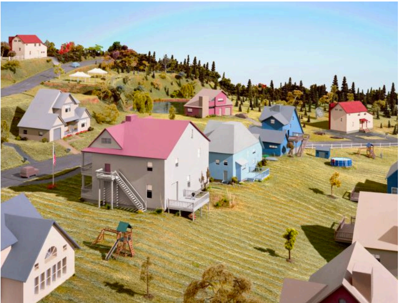
Landscape with Houses (Dutchess County, NY) #4, 2010