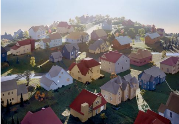
Landscape with Houses (Dutchess County, NY) #1, 2009