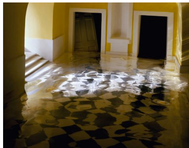
Yellow Hallway #2, 2001