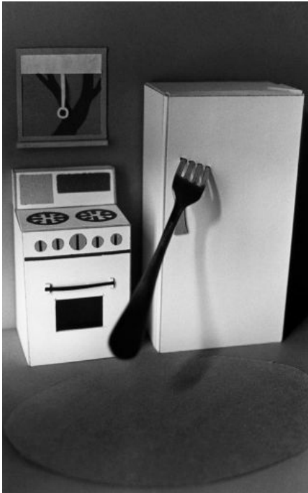
Fork in the Refrigerator, 1975