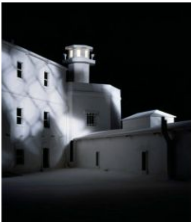
Prison at Cherry Hill, 1992

Works 1975 – 2010, was published this month by Damiani and distributed by D.A.P.