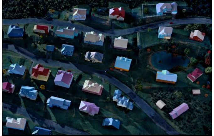
Landscape with Houses (Dutchess County, NY) #2, 2009