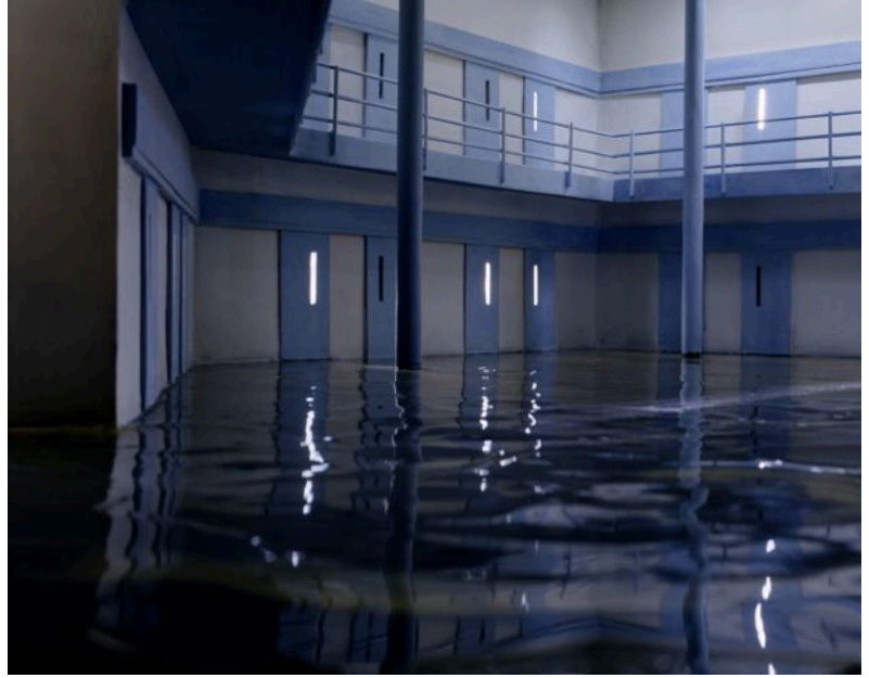
Wichita Falls, 2001