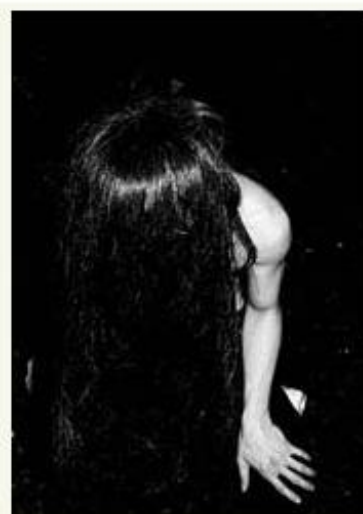
Terence Koh Sprungkopf , 2006 Performance