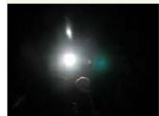
Terence Koh Sprungkopf , 2006 Performance