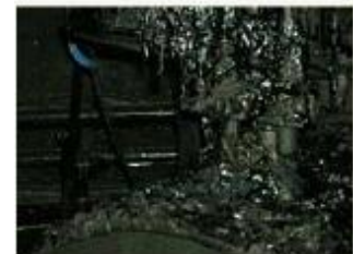
Terence Koh Sprungkopf , 2006 Performance