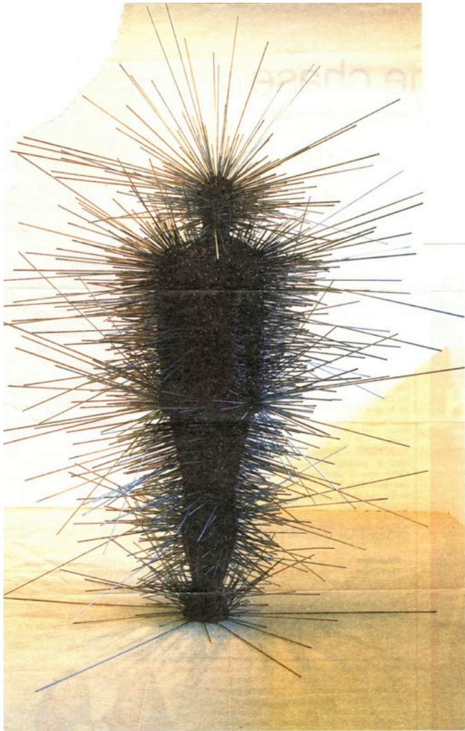
ANTHONY GORMLEY: BLIND LIGHT

of dots suddenly coalesces into a picture of a rearing horse, or whatever. In this case, the metal sprawl becomes the figure of a giant human curled up in a foetal position. Thus, a daunting robotic presence turns cunningly into a vulnerable human one.