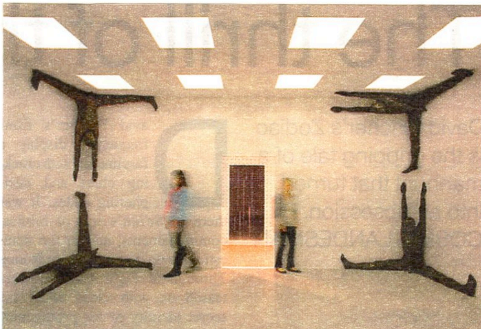
'Everything on view seems determined to sneak inside your intimacy zone and mess about with your sense of place's from left: Blind Light, 2007, with Gormley, second from left; Capacitor, 2001; and Draw, 2000/07

clump of giant metal Lego bricks. It's only when you have circled the heap a few times and examined it from various angles that you begin to discern the human figure hidden inside the messy mountain of Lego. It's like one of those optical puzzles in which an array