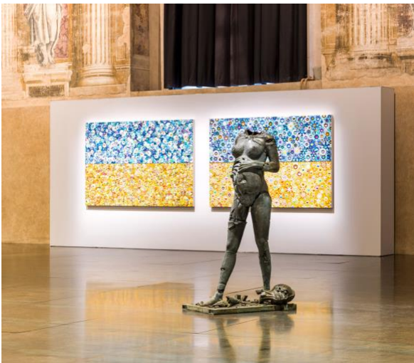
Works by Takashi Murakami and Damien Hirst in This is Ukraine: Defending Freedom at the Scuola Grande della Misericordia