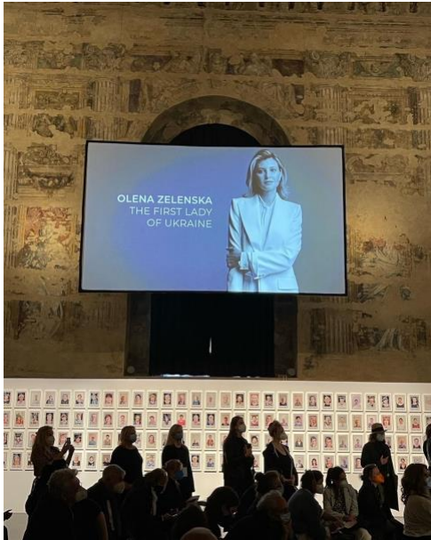
A message from Ukraine's first lady, Olena Zelenska, was also shared at the event

Billionaire collector Victor Pinchuk, whose eponymous foundation is behind the project in Venice, trained as an engineer in the Soviet era, gaining a PhD from the Metallurgical Institute in Dnipro in eastern Ukraine before setting up his own company in 1990 to manufacture a new kind of metal tubing he had invented. He told The Art Newspaper that he was part of a “brainstorming” exercise to select the artists for the exhibition. He added that he plans to “show a victory exhibition” in the future at his art centre in Kyiv. In a speech, he said there had been “genocide against the Ukrainian people”.