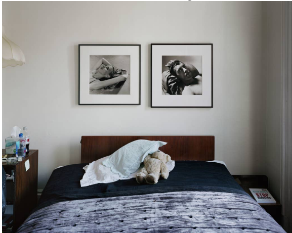
Brooklyn, New York, 2018. Nan Goldin's bed.

"A few years ago I walked into the bedroom of one of my favorite photographers, Nan Goldin, and saw work on the walls of another of my favorite photographers, Peter Hujar."