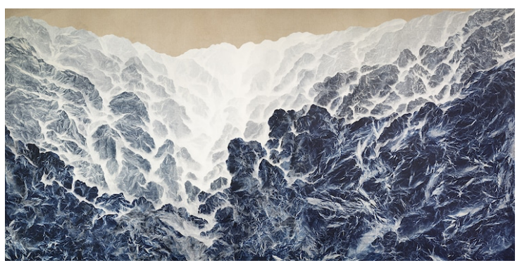
"Cyano-Collage 011," Cyanotype photography, Xuan paper, acrylic gel, 244 cm x 488 cm, 2019