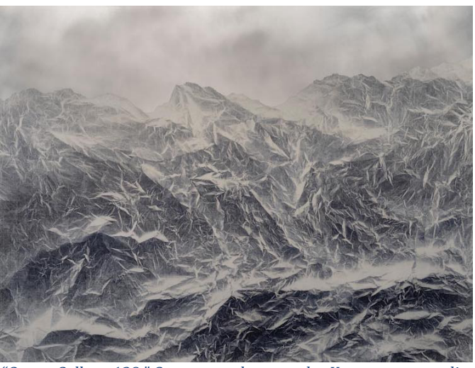
"Cyano-Collage 128," Cyanotype photography, Xuan paper, acrylic gel, acrylic, mounted on aluminum board, 90 cm x 120 cm, 2022