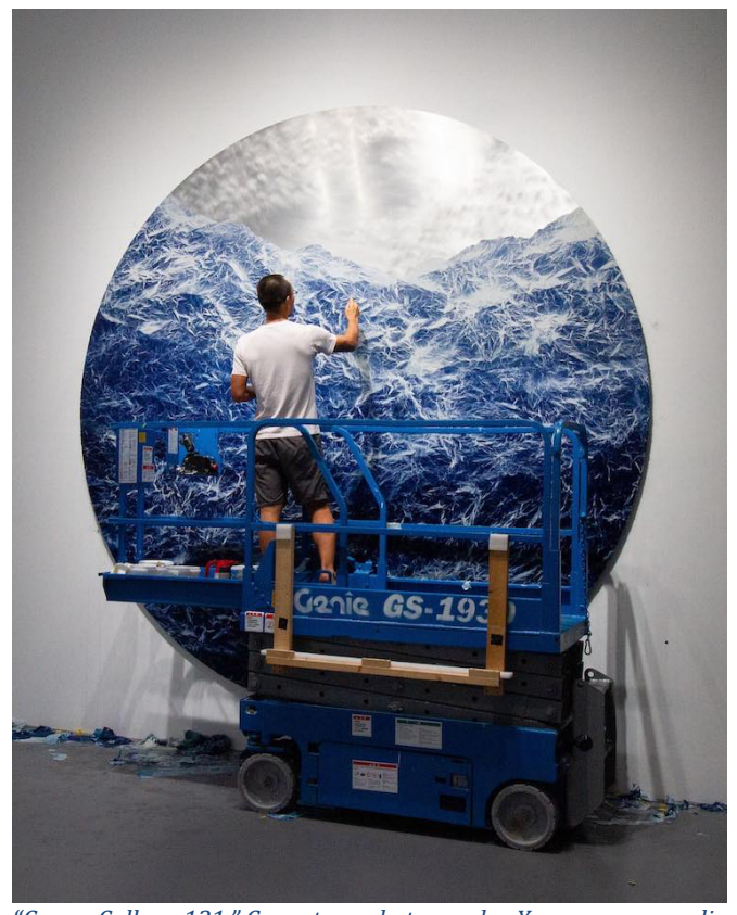
"Cyano-Collage 121," Cyanotype photography, Xuan paper, acrylic gel, acrylic, mounted on aluminum board, 360 cm x 360 cm, 2021