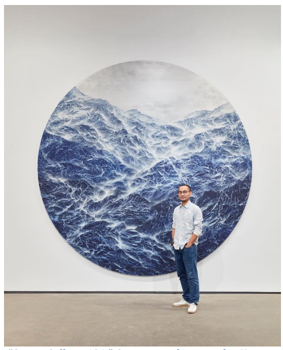
"Cyano-Collage 121," Cyanotype photography, Xuan paper, acrylic gel, acrylic, mounted on aluminum board, 360 cm x 360 cm, 2021

Taiwanese artist Wu Chi-Tsung creates massive works of art that immerse viewers in abstract blue landscapes. The Cyano-Collage series is a new type of art form inspired by Shan shui , or traditional Chinese painting of landscapes, and photomontage. He mounts strips of wrinkled cyanotype Xuan paper onto canvas to create imaginary compositions reminiscent of mountains, oceans, abstract art, and other interpretations.