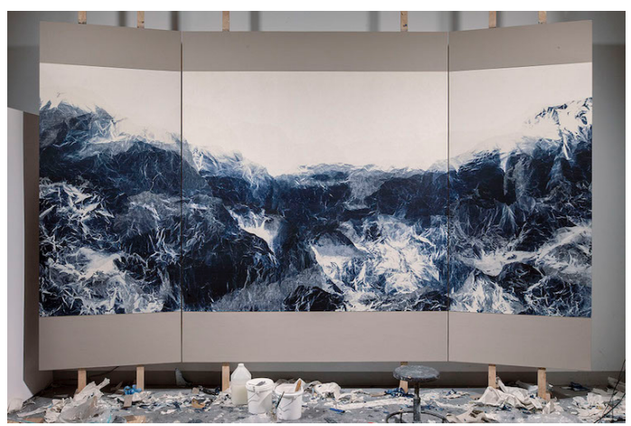
"Cyano-Collage 001," Cyanotype photography, Xuan paper, acrylic gel, 180 cm x 407 cm, 2016