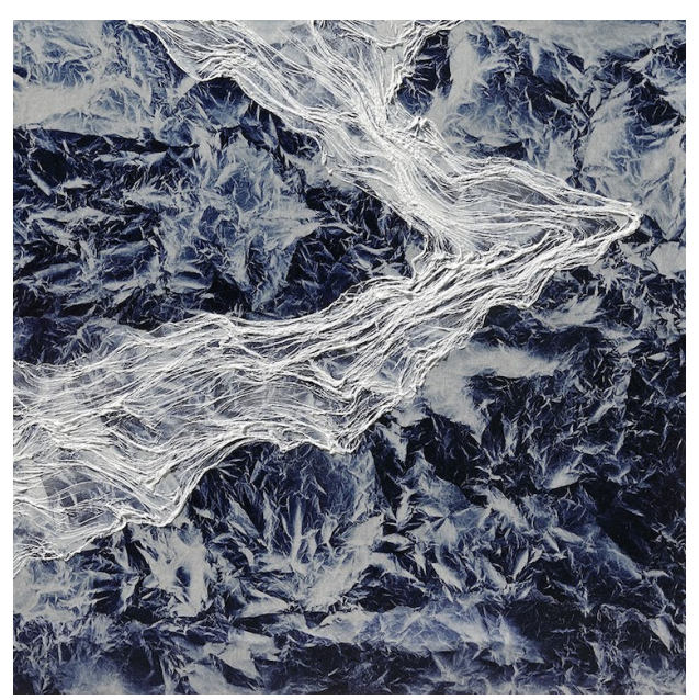
"Cyano-Collage 061," Cyanotype photography, Xuan paper, acrylic gel, silk, 205 cm x 205 cm, 2019