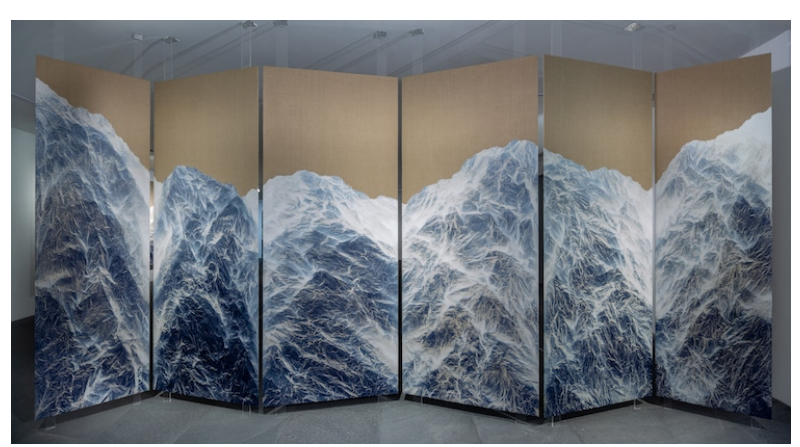
Installation view of Cyano-Collage 094 at solo exhibition exposé in Hong Kong

Artist Wu Chi-Tsung creates spectacular collages of textured mountains with crinkled cyanotype Xuan paper.