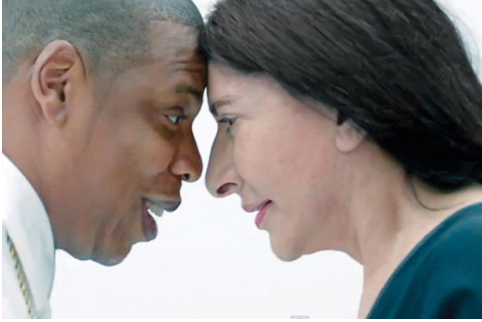
Abramovic and Jay Z during his performance-music-video shoot for "Picasso Baby."