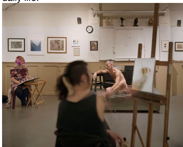
Alec Soth - Plastic Arts Club. Philadelphia, Pennsylvania, 2019 archival pigment print mounted on Dibond covered with Lenox 100 paper. Image/paper: 40 \times 50 inches (101.6 x 127 cm) framed: 44 \times 1/2 \times 54 \times 1/2 \times 21/4 inches (113 x 138.4 x 5.7 cm). Edition of 0 with 4 APs. Signed by artist on label, verso

Coinciding with the release of his monograph A Pound of Pictures , the photographer's solo exhibition , which will be mounted across three venues, highlights a new chapter in his kaleidoscopic observations of the iconography of daily life.