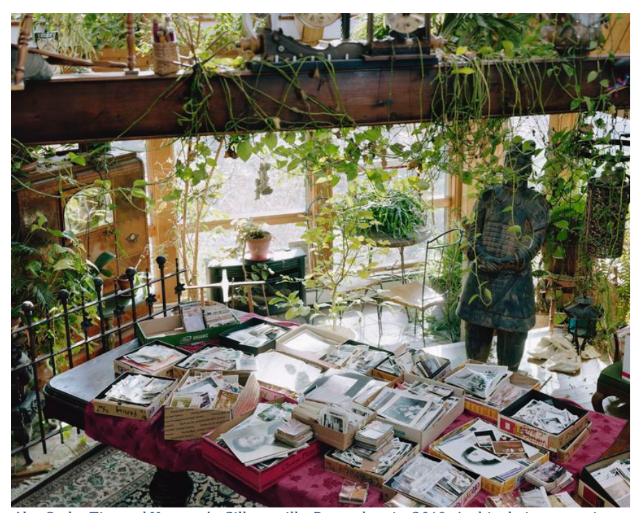
Alec Soth - Tim and Vanessa's. Gilbertsville, Pennsylvania, 2019. Archival pigment print mounted on Dibond covered with Lenox 100 paper. Image/paper: 52 \times 65 inches (132.1 x 165.1 cm), framed: 56 \times 1/2 \times 69 \times 1/2 \times 21/4 inches (143.5 x 176.5 x 5.7 cm). Edition of 9 with 4 APs, signed by artist on label, verso AS-PP.19.69

A Pound of Pictures turns out to be self-reflective interrogation of Soth's entire oeuvre. From Buddhist statues and birdwatchers to sun-seekers and a bust of Abraham Lincoln, the series reflects a specific way of seeing based on the agenda of crystallizing experience.