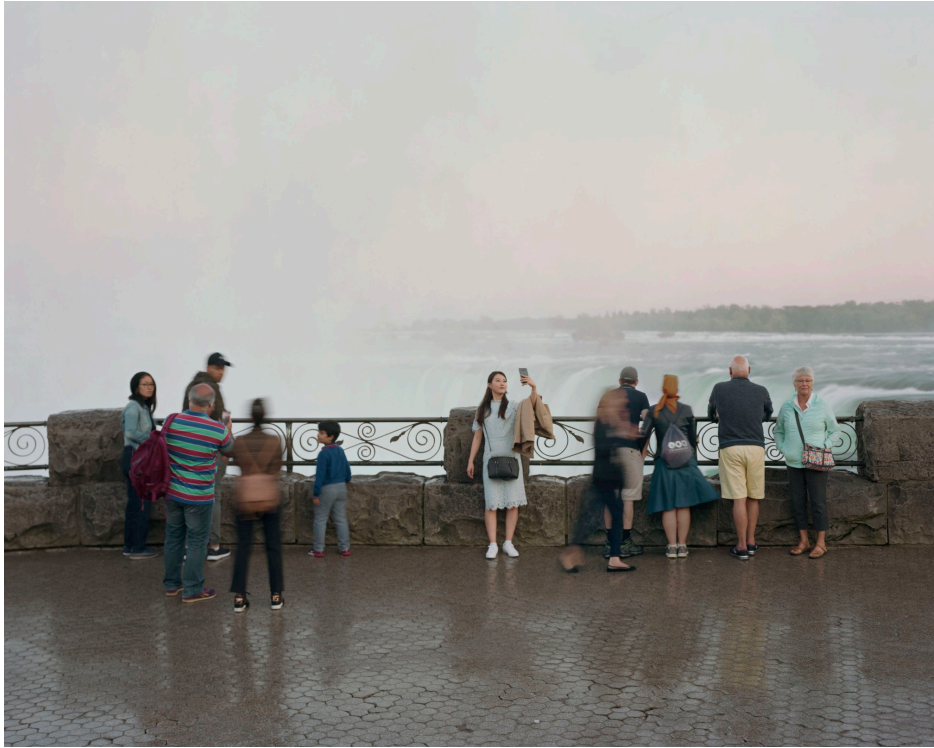
Niagara Falls, Ontario., 2019.

by their weight in pounds. Many of the pictures he purchased there appear throughout the exhibition — in Tim and Vanessa's. Gilbertsville, Pennsylvania , 2019, and Abandoned house. Coahoma, Mississippi , 2021, stacks of nameless faces are arranged with an anthropomorphic sensibility as the focus of Soth's camera, positioned as delicate still lifes composed of lost memories.