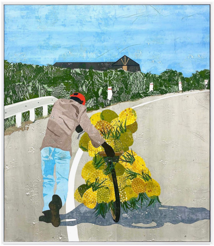
Hugo McCloud, Pineapple Express, 2020.