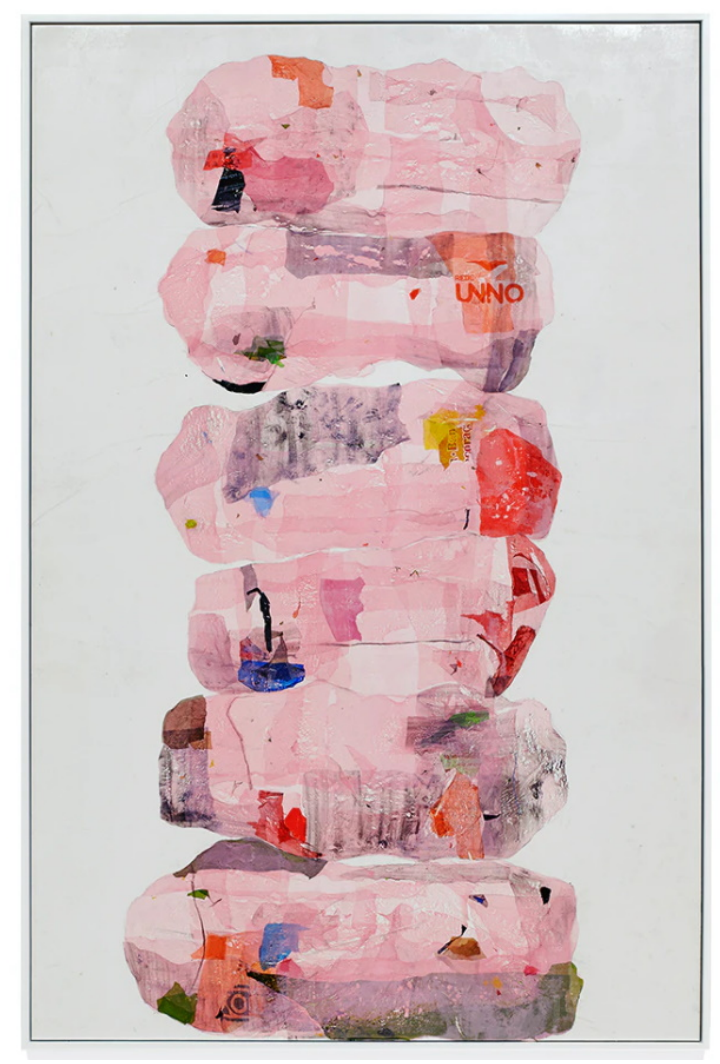
Hugo McCloud, Untitled – consumption stacks, pink, 2018.