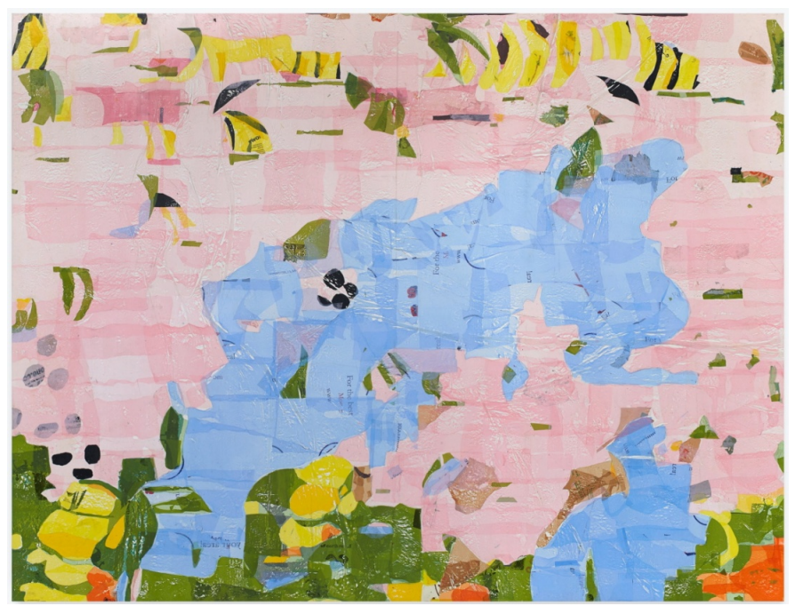
Hugo McCloud, peeled apart, 2018.