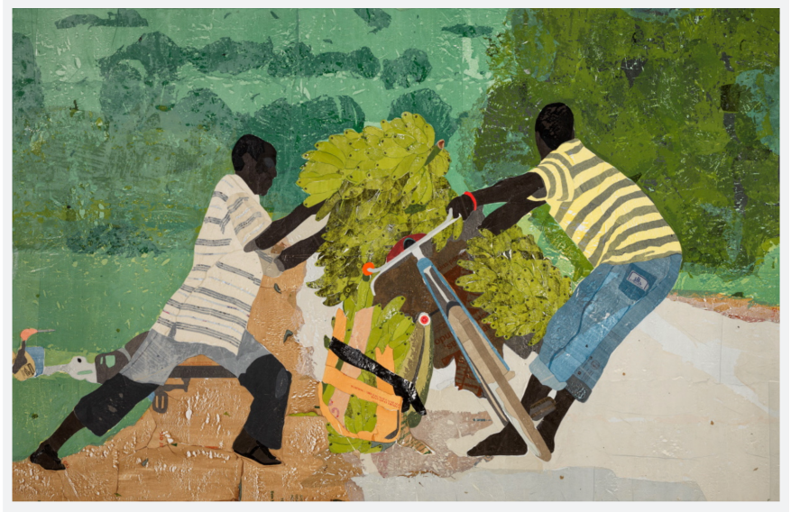
Hugh McCloud, push pull, 2019.