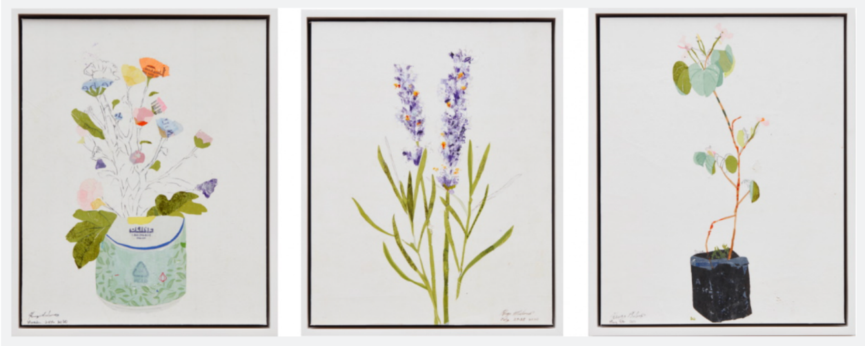
Hugo McCloud, March 28, 2020; July 27-28, 2020; May 5, 2020; all 2020.