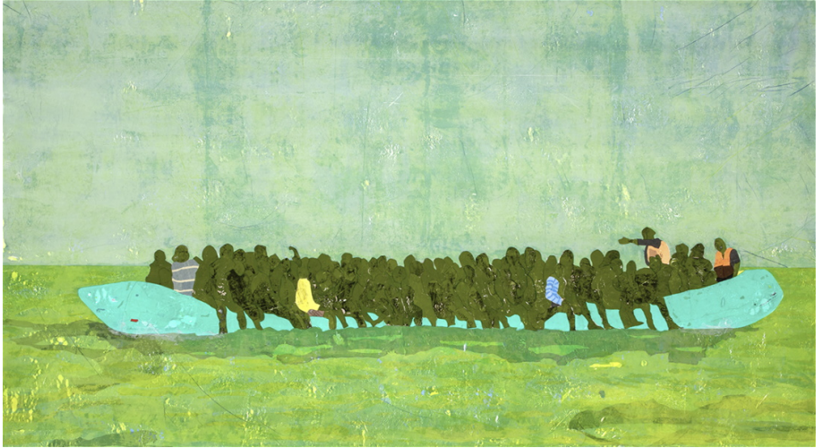
Hugo McCloud, the day before friday the 12th, 2020.