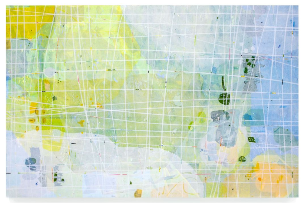
Hugo McCloud, bundled truths, 2020.