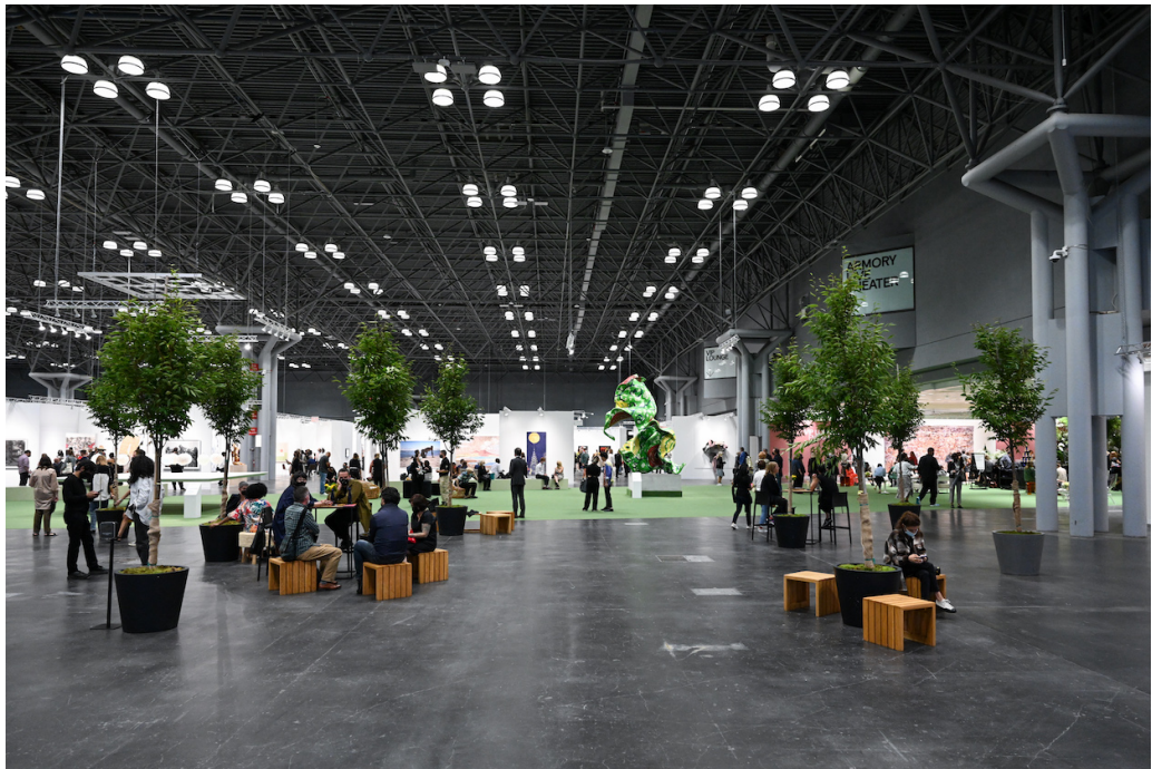
The Armory Show at the Javits Center.