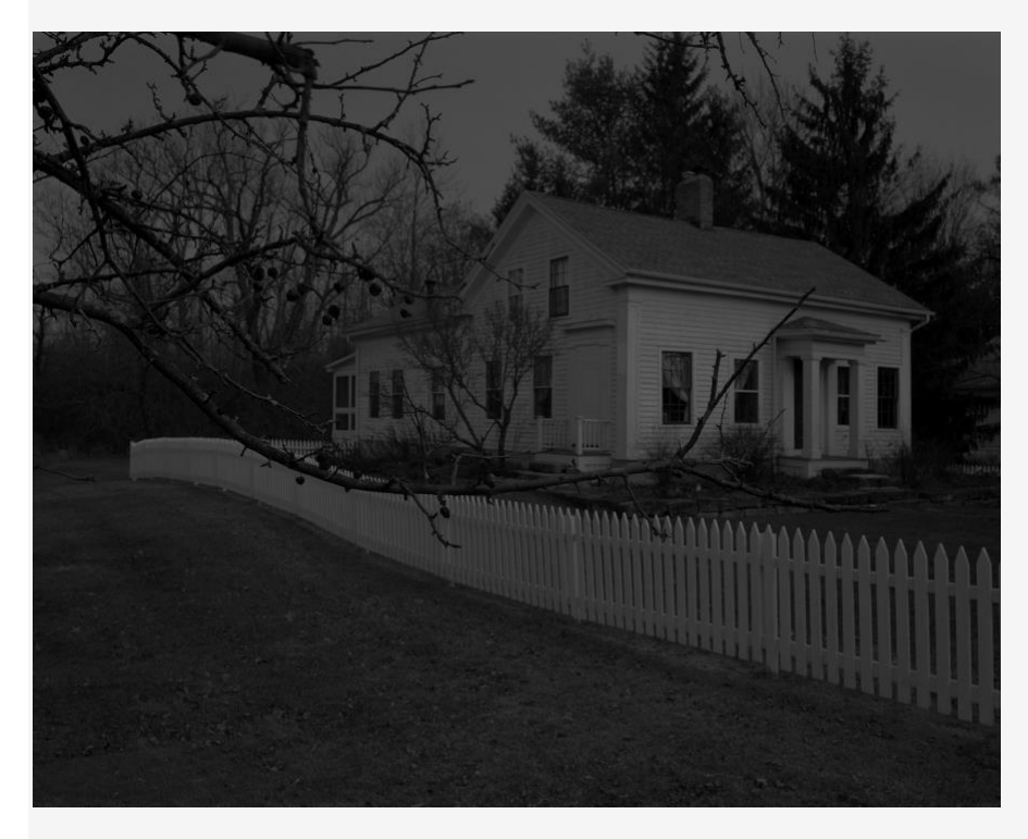
Untitled #20 (Farmhouse and Picket Fence I), from Night Coming Tenderly, Black, 2017.