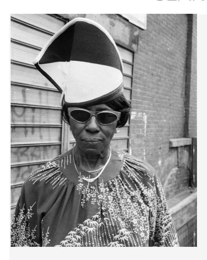
A Woman at Fulton Street and Washington Avenue, Brooklyn, NY, 1988.