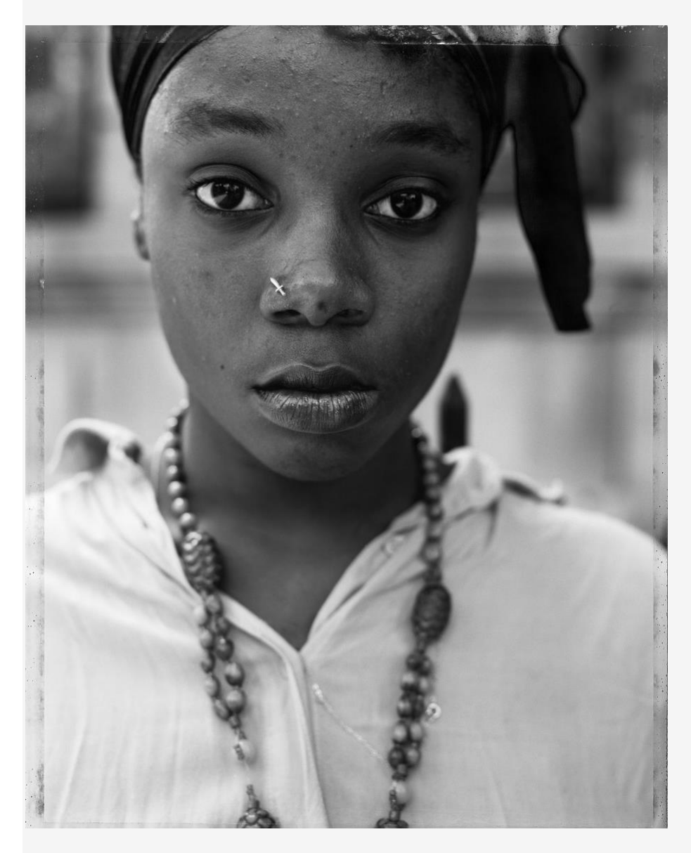
A Girl with a Knife Nosepin, Brooklyn, NY, 1990.

years the artist Dawoud Bey observed this steady flow of everyday Black beauty, occasionally pulling a face out of the crowd to make a picture with his Polaroid Type 55 camera. He photographed in close proximity, usually with very few background details, and printed large, in luminous black and white tones, so that one can look directly into the eyes of Bey's friends and neighbors. The pictures, Hilton Als has written, "conveyed the satisfaction of being seen, which is a form of brotherhood and love, too."