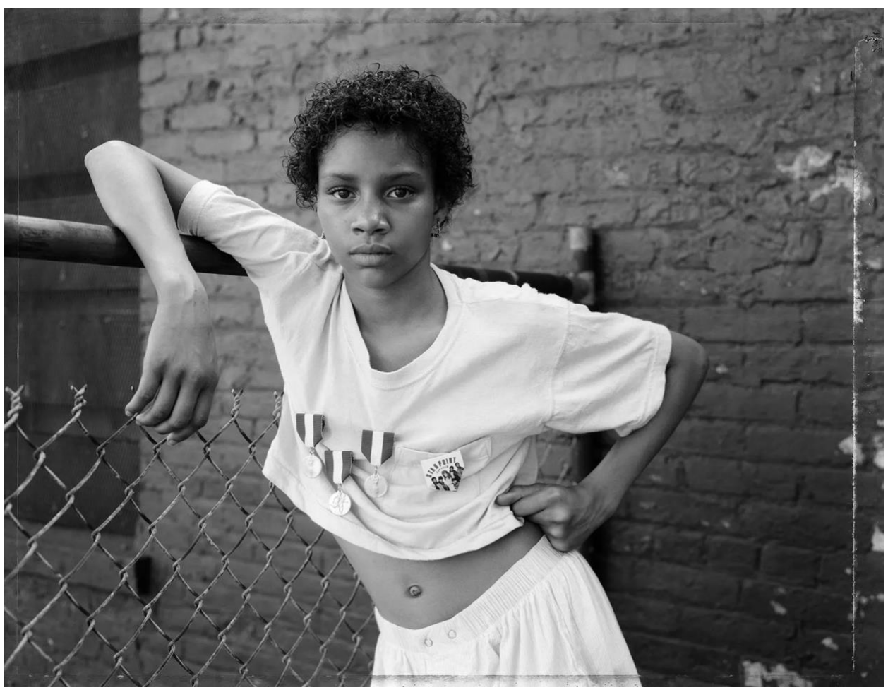
A Girl with School Medals, Brooklyn, NY, 1988.

The apartment house on Cambridge Place in Clinton Hill is quintessentially Brooklyn, a stately foundation propping up faded pale brick, with curved bow windows and wrought iron detailing on its fence and front door, seemingly unchanged for years. Its wide stoop has a vantage onto a lively swath of Fulton Street, the destination and origin of much of its foot traffic. From 1978 to 1991, those coming and going included preteens striking a pose in overalls, bookish young boys, young MCs and track stars, little girls in Sunday dress, men and women headed to the cleaner, the barber, the bodega. During those