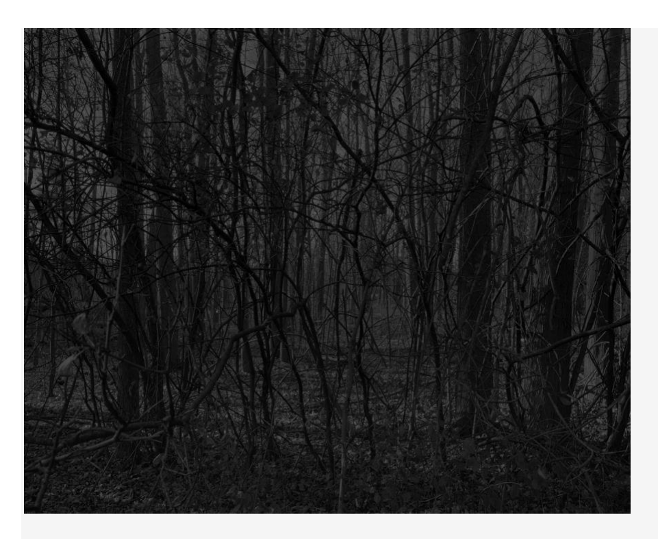
Untitled #17 (Forest), from Night Coming Tenderly, Black, 2017.

© DAWOUD BEY/WHITNEY MUSEUM OF AMERICAN ART.