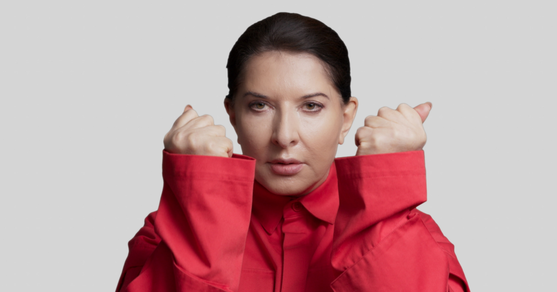
Marina Abramovic in a film still from Body of Truth (2019)

Marina Abramovic's quest for world domination continues apace with her latest venture—a partnership with WePresent, the editorial arm of the file-sharing platform WeTransfer. Later this year, Abramovic will unveil a digital manifestation of The Abramovic Method on the site. According to the artist the participatory performance is "the exploration of being present in both time and space. It incorporates exercises that focus on breath, motion, stillness and concentration." This meditative task "will be available to everyone, all day, every day, reaching 70 million people worldwide", says the company.