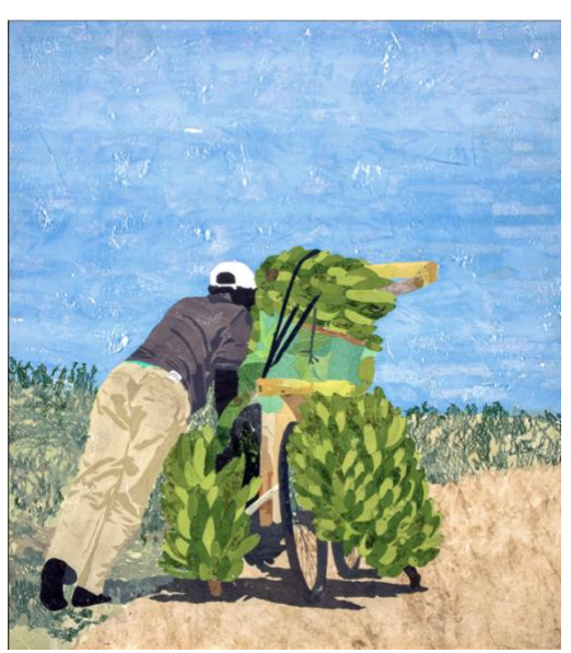
Hugo McCloud: come and go , 2020, single use plastic mounted on panel, 70 by 60 inches; at Sean Kelly, New York.