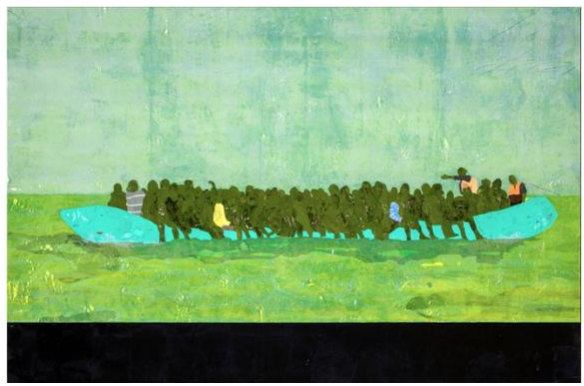
Hugo McCloud: the day before friday the 12th , 2020, single use plastic mounted on panel, 55 by 84 inches; at Sean Kelly, New York.

Pushing the bounds of what a material can do is the basis of <a href="Hugo McCloud">Hugo McCloud</a> art. He has worked with numerous substances, primarily industrial and discarded, such as tar paper and scrap metal. <a href="Plastic">Plastic</a>—in the form of single-use plastic bags—is the medium of his latest "paintings," on view in <a href="the solo exhibition">the solo exhibition</a> "Burdened" at Sean Kelly in New York through February 27. Drawn to the colors and logos printed on plastic bags that he encountered in his travels, McCloud previously fashioned plastic strips into grid patterns. Now, however, the California-born self-taught artist has created figurative compositions using the material to depict refugees, migrants, and laborers. Below, he discusses his ongoing influences alongside new ideas that have emerged from his experience creating images with plastic.