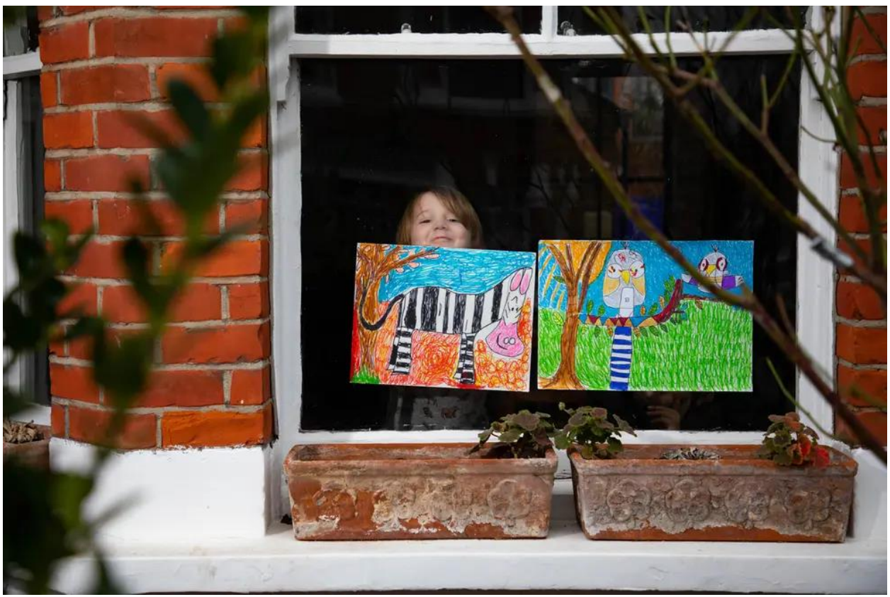
The Great Big Art Exhibition hopes to be the nation's largest ever exhibition

There is a huge reservoir of untapped energy that is full of creative juice," Sir <u>Antony</u> <u>Gormley</u> tells me over the phone, his voice filled with excitement.