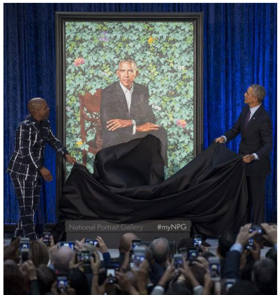
Former U.S. President Barack Obama unveils his portrait alongside the portrait's artist, Kehinde Wiley, at the Smithsonian's National Portrait Gallery in Washington, D.C., on Feb. 12, 2018.

Richmond, Va., has been an epicenter of the controversy. Its most prominent city symbols — a procession of sculpted Civil War leaders — just sparked protests for days. The statues stand near the Virginia Museum of Fine Arts, where a contemporary sculpture by Kehinde Wiley reminds that Black lives not only matter, they can create powerful, stunning works of art. Wiley, a 43-year-old African American artist, is best known for painting an official portrait of President Barack Obama at the National Portrait Gallery.