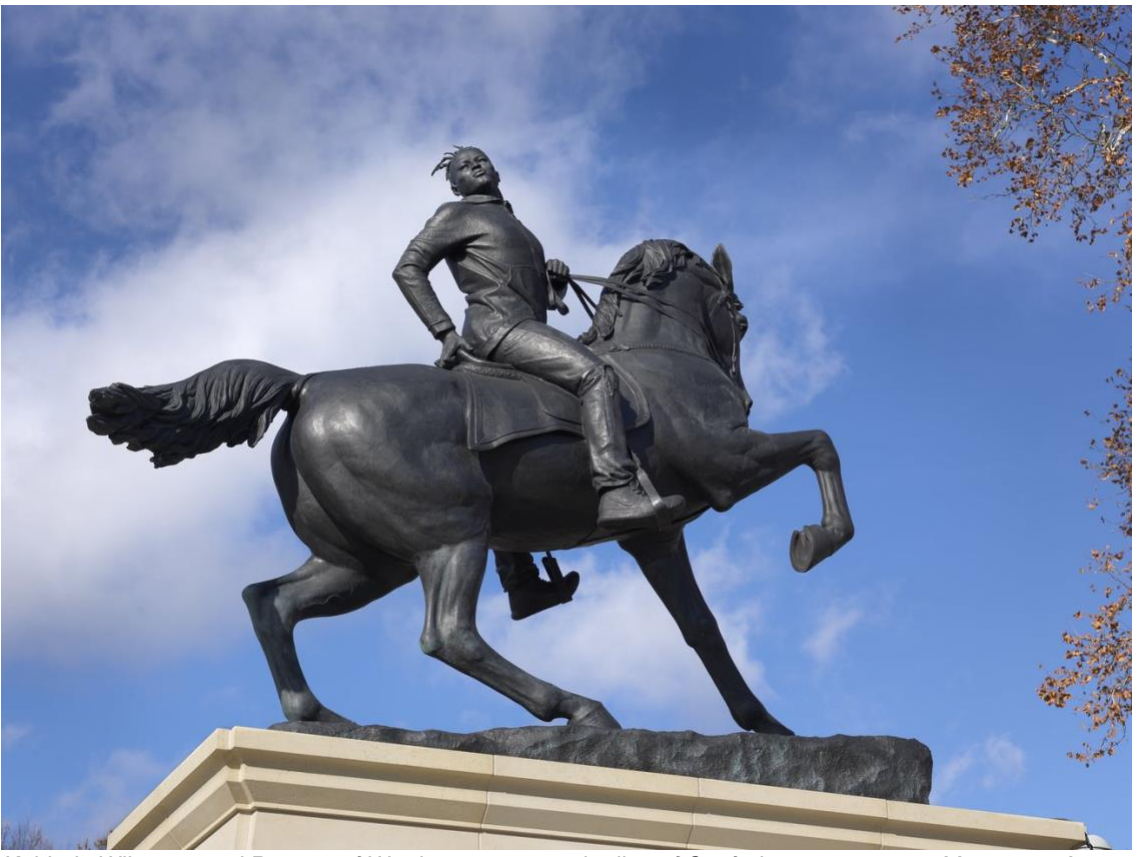
Kehinde Wiley created Rumors of War in response to the line of Confederate statues on Monument Avenue in Richmond, Va.

It's raining statues all across America. <u>Artworks</u> that have stood in public places for generations are being defaced or deposed, destroyed or relocated, as Americans confront attitudes on race and stereotyping.