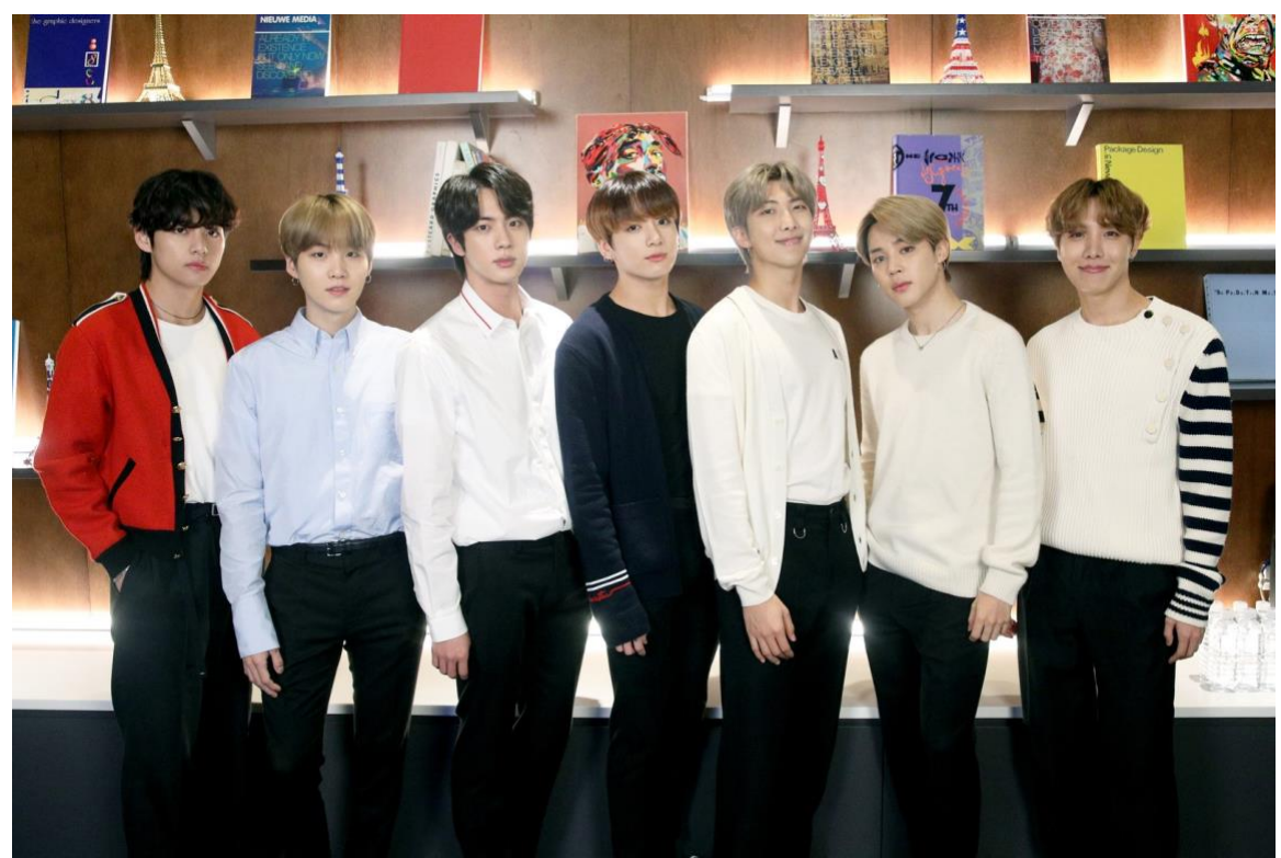
The band at the January launch announcement of Connect, BTS.

This isn't the London-based artist's first appearance in New York. In 1984, he had his first solo gallery exhibition in the city, and a decade ago he installed the public art exhibition Event Horizon , a series of 27 life-size human forms placed at the edges of rooftops in Madison Square Park. The forms' precarious positions, understandably, sparked some controversy).