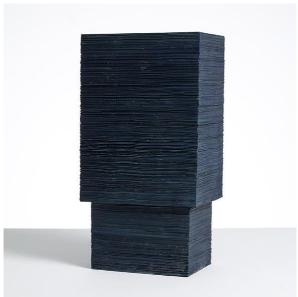
'My Mother' (2019)