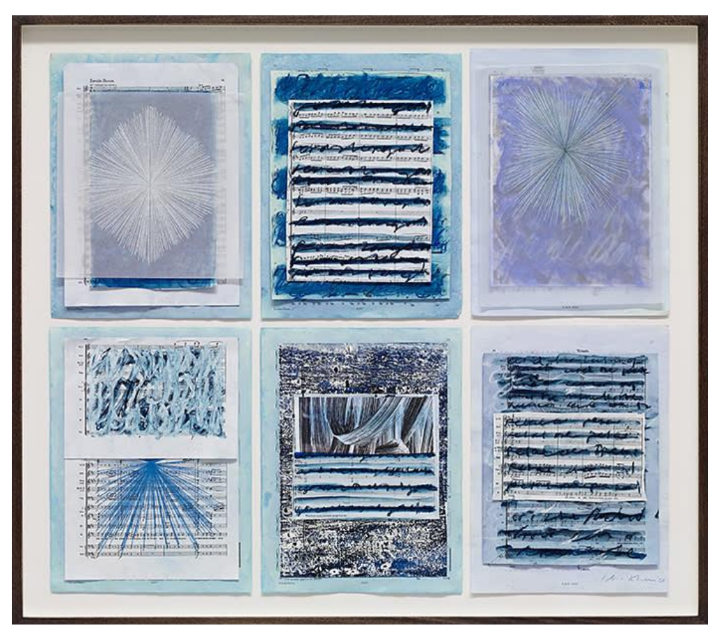
'Collage with six drawings' (2019) © Victoria Miro

He doubts that "someone with a western name could have made the Koran piece", for example, or been commissioned, as Khan was, to build a memorial to the war dead of the United Arab Emirates. That sculpture, unveiled in 2016, is constructed from seven aluminium-encased steel tablets; 23m high, they are cast with poems by emirs of the UAE.