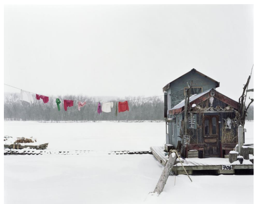
Peter's houseboat, 2002 Alec Soth

"As for me, I'm invariably interested in the tactile aspect of photography. You can ask why we need exhibitions of photography now in the digital age — why you would have that. Just last night at the opening reception of the festival, someone came up to me and was, like, 'I can't believe what I'm seeing. I have seen these pictures for years on a computer screen and it is so much different now.' And I said, of course it is. It's like listening to a song on your iphone and then going to a live concert where you feel the power of the physical performance."