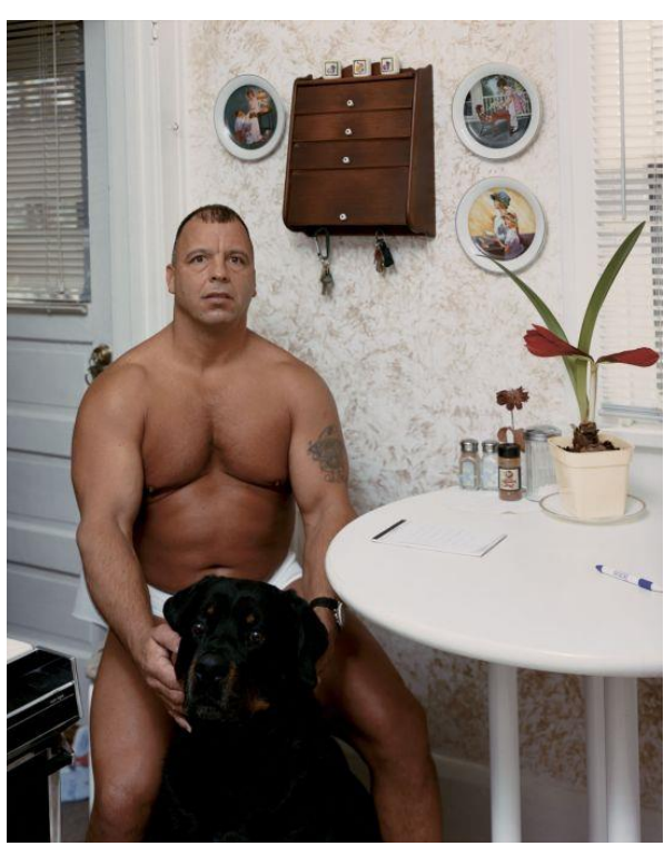
Lenny, 2002. Alec Soth

On his first-ever trip to Israel, American photographer Alec Soth came without a camera, except for the one in his cellphone. That might not be surprising, considering that Soth, one of the most highly regarded photographers today, creates his work by means of a long and expensive process, using a large format manual camera perched on a heavy tripod – certainly not something that's easy to pack up for a visit of a few days.