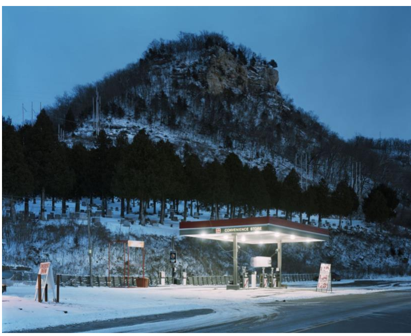
Cemetery, 2002 Alec Soth

Soth would prefer that readers not look at the photos accompanying this article. He would rather you leave your homes and see them printed out and mounted, full-size at the Tel Aviv festival, a 10-day event on through December 7, which is being held in the Azrieli Sarona Tower and features the works of 250 artists from Israel and abroad.