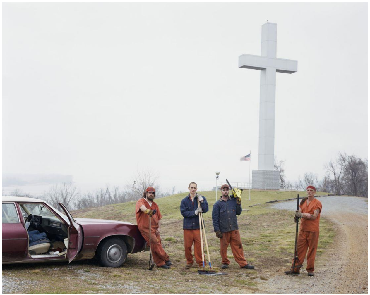
Fort Jefferson Memorial Cross, 2002, Alec Soth

In recent years, following the political changes rocking the United States, Soth worked for almost a year on a project that was intended to show those transformations – but in the end he set it aside, after he realized that it just wasn't his style.