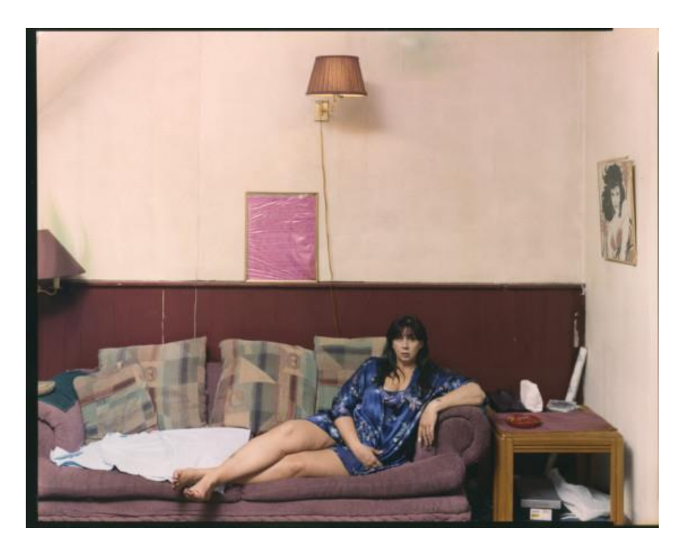
Alec Soth Davenport, Iowa. USA. 2002. © Alec Soth | Magnum Photos