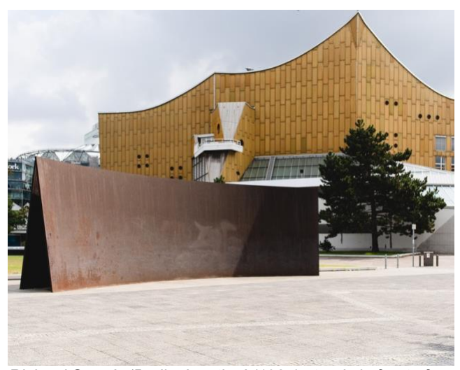
Richard Serra's 'Berlin Junction' (1987) stands in front of the Berliner Philharmonie