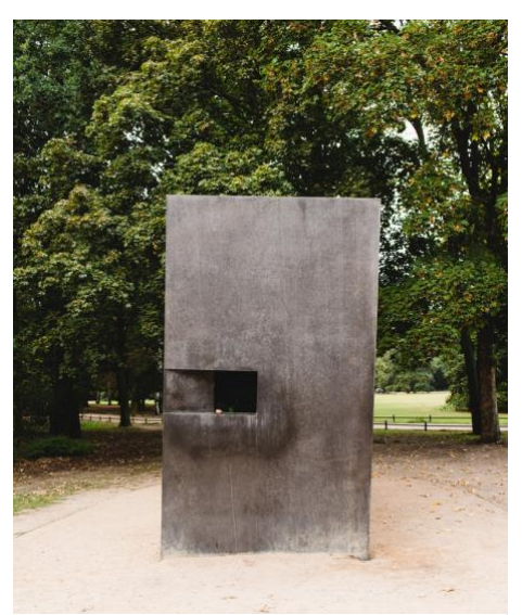
Elmgreen and Dragset, 'Memorial to Homosexuals Persecuted Under Nazism', 2008

who was also involved in the design of the main Holocaust memorial, honours the victims of the Nazis' T4 programme, in which people with physical and mental illnesses were systematically put to death through "involuntary euthanasia".