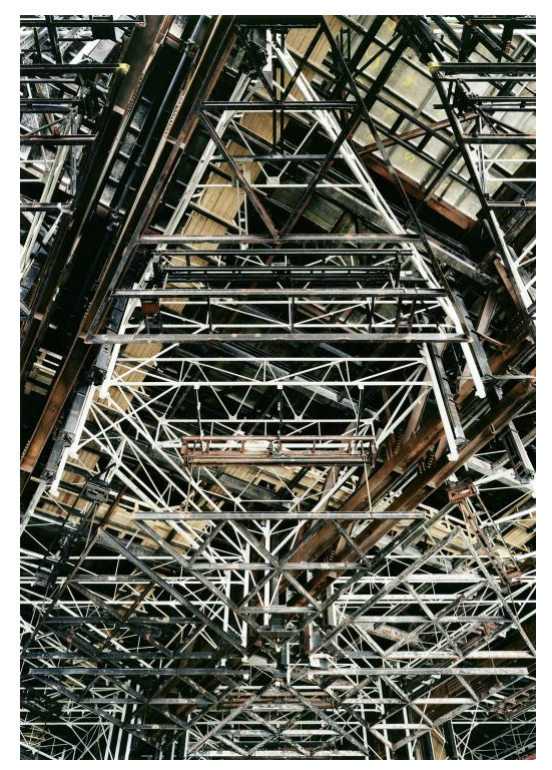
Frank Thiel, 'Untitled (Palast der Republik #06)', 2003 Courtesy of Blain|Southern, London/Berlin/NewYork, Sean Kelly Gallery, New York/Taipei © VG Bild-Kunst, Bonn