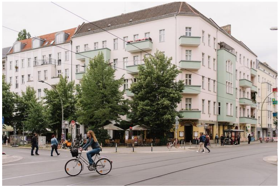
Boxhagener Straße is lined with a number of shops and restaurants

The current architectural development is of particular interest to artist Frank Thiel, who photographed the Palast der Republik just before demolition began, in 2003, as part of a series of untitled works about the changing architecture of Berlin after the Wall fell.