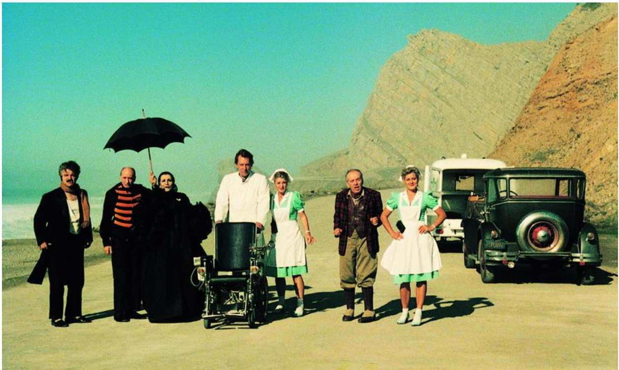
Rebecca Horn – Buster's Bedroom ,1990. Rebecca Horn Workshop. Adagp, Paris, 2019

The exhibition title indicates that the installment as a whole functions as an immersive environment filled with playfulness, humor, and imagination; the interplay of films, sculptures, and mechanized objects tends to show Horn's perception of metamorphosis in broader terms of the human rituals and life cycles.