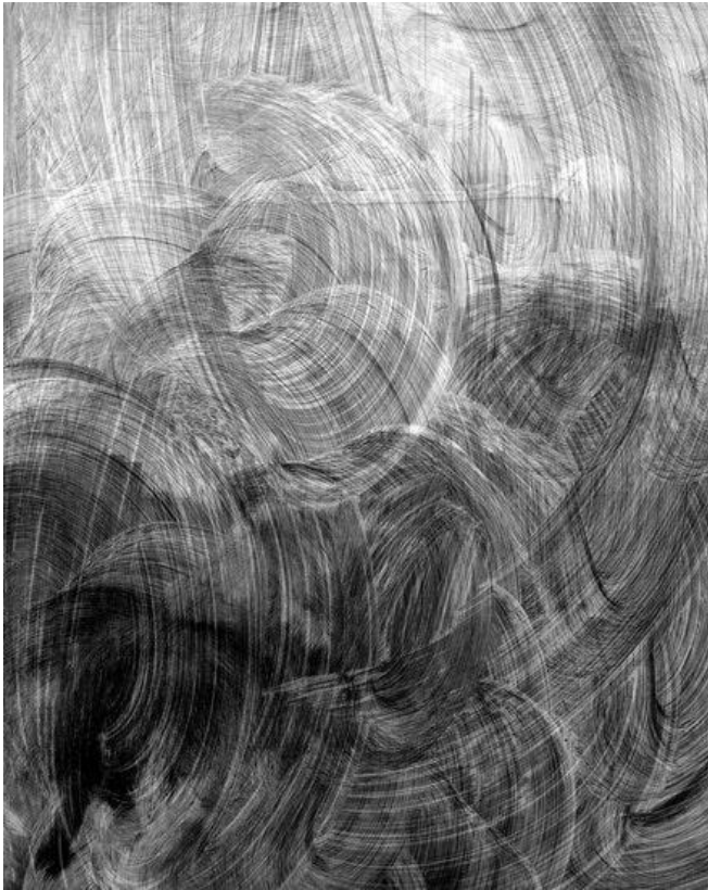
Idris Khan, White Windows ; September 2016 - May 2018, 2019, digital fibre print, image: 50 3/16 x 40 3/16 inches (127.5 x 102.1 cm), paper: 57 5/16 x 47 5/16 inches (145.6 x 120.2 cm), framed: 61 7/16 x 48 7/16 x 2 3/4 inches (156.1 x 123 x 7 cm). Edition of 7 with 2 APs. © Idris Khan. Courtesy: Sean Kelly, New York

One of the real pleasures in viewing the ensemble of works is the sensitivity with which the artist modulates the monochromatic theme of the show with its achromatic tracery. A good example of this is The Calm is But a Wall (2019), a very large digital C print (71 x 113") in which a repeated score of musical notation is repeatedly over-printed in white. The repetition and overprinting make the score barely legible and certainly not viable for musical translation. The erasure of the score's time signature therefore needs to be read differently. The title suggests that Khan's version of a "wall of sound" is meant to express, paradoxically, the illusion of quietude and the impasse of measured intervals,