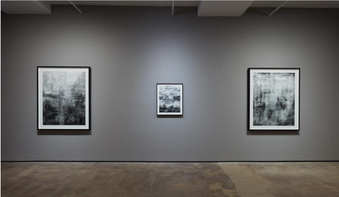
Installation view of Idris Khan: Blue Rhythms at Sean Kelly, New York, May 4 - June 22, 2019.

In the downstairs section of the gallery are assembled a series entitled “White Windows” (all circa 2019). Like the work upstairs these are framed digital photographic prints, but unlike that work these are much more fluidly expressionist. This section of the show also moves toward the fully achromatic and so subsequently Khan’s graphic skills come strongly to the fore. Upon my first impression of the ensemble a colloquial memory of soaped-up windows of abandoned commercial storefronts came to mind. The same will toward an optical obliteration rules here as in the artist’s text based works. The broadly brushed (wiped?) and recursive arabesques of White Windows September 2016–May 2018 (2019), for example, build in workmanlike yet impetuous folds in which subtle tonalities are achieved in an almost offhand manner. Leonardo Da Vinci’s apocalyptic deluge drawings are obliquely invoked here, as are Jasper Johns’s rich accumulation of visual textures in that artist’s encaustic as well as graphic works. As a whole this series offers a light and welcome respite to the more portentous work upstairs and highlights Khan’s ample capacity for graphic lyricism. And White Windows makes poignantly explicit his quixotic attempt to simultaneously represent and erase the passage of time’s signatures.