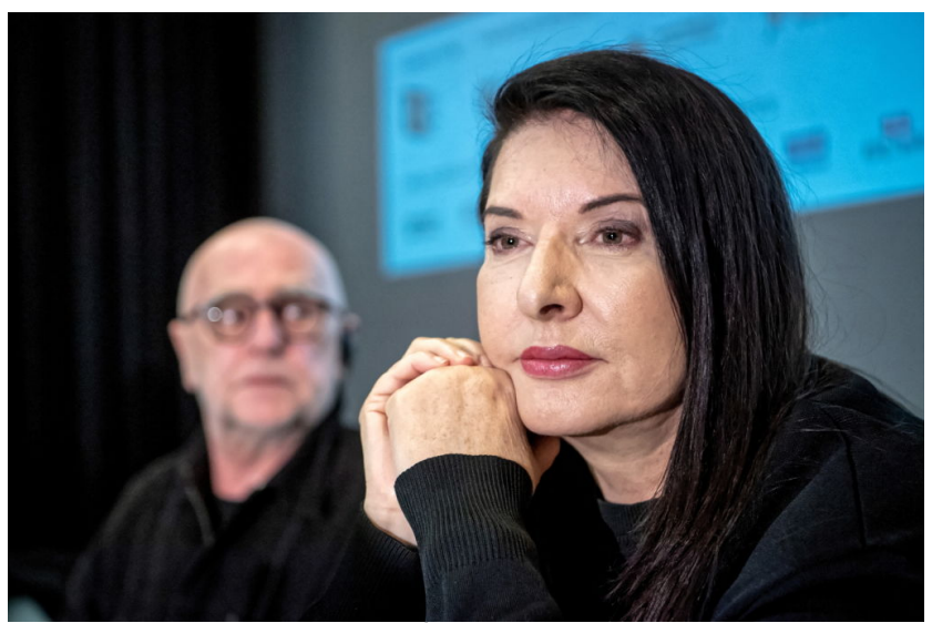
Marina Abramović

– When it comes to emotional pain, it is gone. I'm happy. Really happy – she confessed in an interview with TVN24 Magazine.