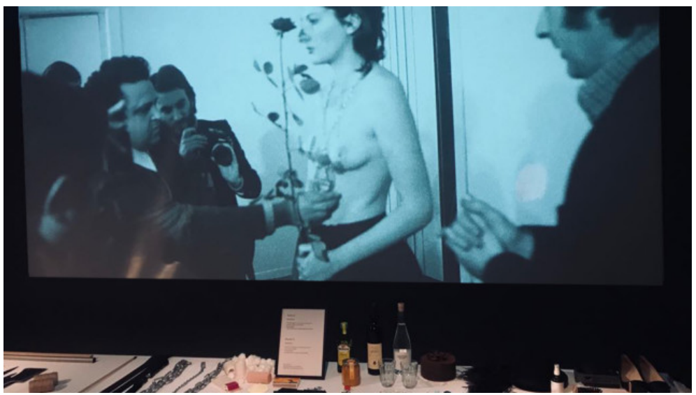
Documentation of "Rhythm 0" presented at the Center for Contemporary Art in Toruń

There were 72 items on the table, including a knife, a scalpel, pins, a chain and a loaded weapon. The audience had six hours, she could do anything with her. As time approached, Abramović was bloody, half-naked and with tears in her eyes. Then someone grabbed the weapon. She decided to risk that only later.