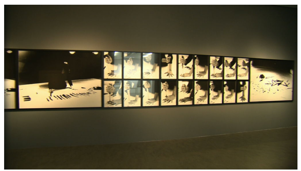
Documentation of "Rytm 10" presented at the Center for Contemporary Art Znaki Czasu in Toruń

In 1973 she received an invitation to Edinburgh, where she surprised the world for the first time. She presented the first work from the cycle "Rhythm" – "Rhythm 10". It was an action in which she used the motif drunken game: on the table a hand spread with fingers and as quickly as possible a knife edge in between. Abramović rolled out a piece of white paper on which she knelt and spread ten knives. She started the action, used all the tools in turn and the associated groaning of pain when she hurt – she took it. "Fear and pain are gone, I have become a marina that I have never known before" – remembers the first strong experience.