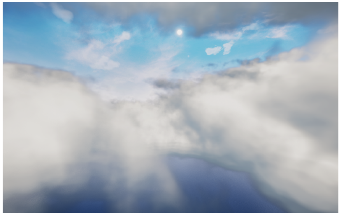
Antony Gormley, Lunatick (2019), still.