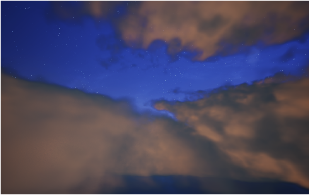
Antony Gormley, Lunatick (2019), still. Courtesy of Antony Gormley Studio and Acute Art.

Lunatik is due to lift off at the Store X in London on April 5. See more images from the project below.