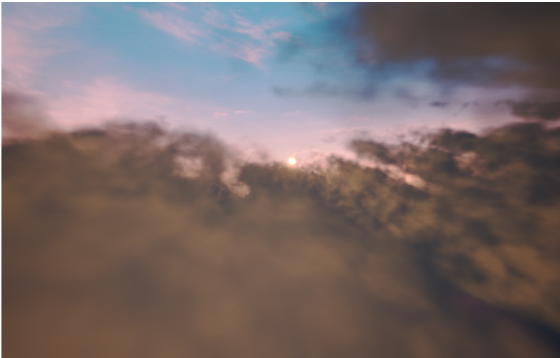
Antony Gormley, Lunatick (2019), still.

"Antony Gormley: Lunatick" is on view at the Store X, 180 Strand, London WC2R 1EA, April 5–April 25, 2019. Hours are Tuesday–Sunday, 10 a.m.–6 p.m. Tickets are £5 ($6.50) can be purchased here.