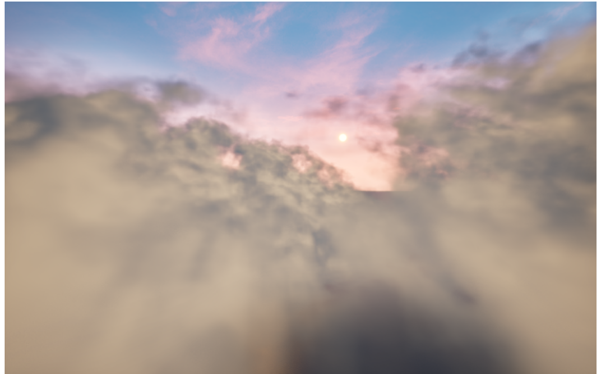
Antony Gormley, Lunatick (2019), still.