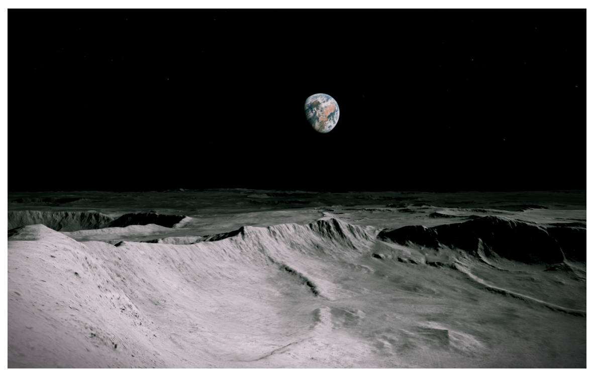
Antony Gormley, Lunatick (2019), still.