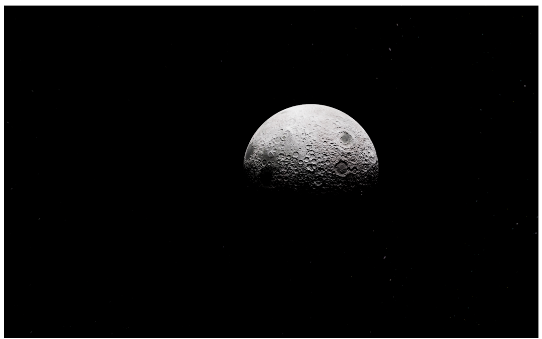
Antony Gormley, Lunatick (2019), still.