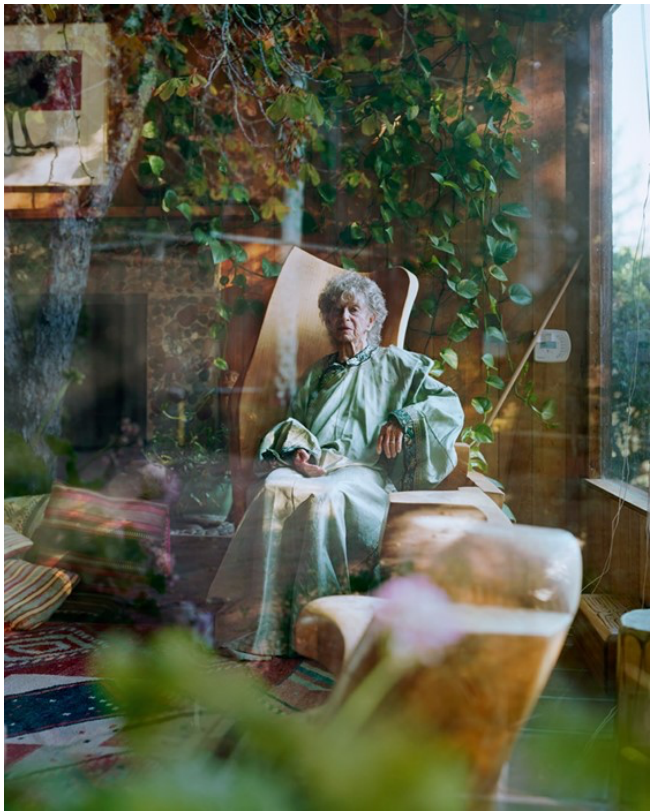
Alec Soth, Anna, Kentfield, California, from I Know How Furiously Your Heart is Beating (2019) Courtesy of the artist and MACK

"There is this experience with the camera I used in this project. You're tucked under the dark cloth, you're hidden, and you're looking at this picture – albeit upside down – but you're looking at the subjects and you use this little magnifying glass and can look right in to their eyes. It's just such an incredible, sensual feeling; it's such a delight. And the photograph is a representation of that strange intimacy-slash-distance."