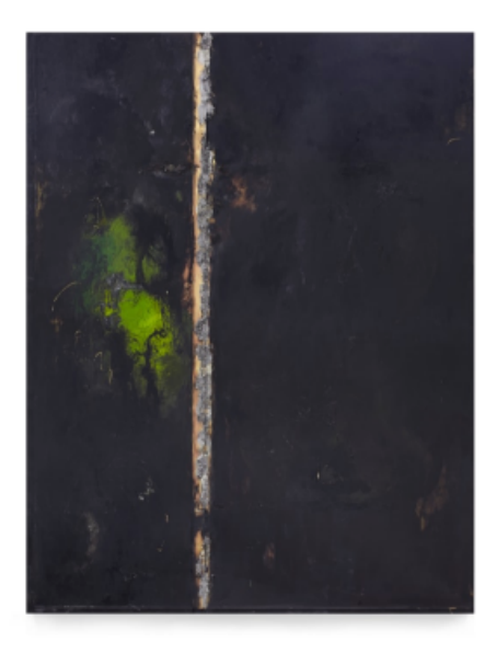
Lotus, 2017, patina, oil stick, solder on solid bronze sheet, mounted on aluminum frame.