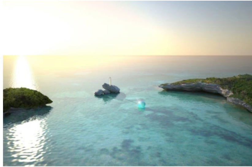
Mariko Mori, Primal Rhythm: Seven Light Bay Project, Miyako Island, 2009

The result was a body of work in which she no longer appeared: architectural installations resembling shrines, including one remarkable—but still unfinished earthwork on Miyako-jima, off the coast of Okinawa. It consists of a monumental pillar erected on a rocky promontory in the sea, combined with an egg-shaped dome floating below it that changes color with the tides. Once the entire ensemble is completed, the shadow of the pillar will bisect the dome on the winter solstice.