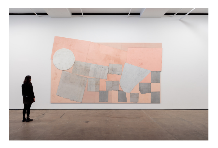
Wide Wake Until 16 December at Sean Kelly, New York skny.com