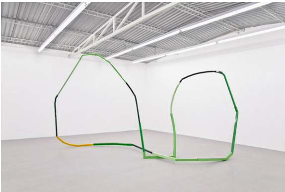
Jose Dávila, Daylight Found Me with No Answer , 2013. Metal frames and enamel paint, 550 x 250 x 270 cm., Courtesy of Galleri Nicolai Wallner, Copenhagen, 2015. Photo: Alejandra Jaimes

His studio is located on Colonia Artesanos in downtown Guadalajara in a workshop neighborhood whose chaotic atmosphere signifies what many consider to be a specifically Mexican aesthetic. Daylight Found Me with No Answer is also the name of a Dávila sculpture made of twisted metal frames.