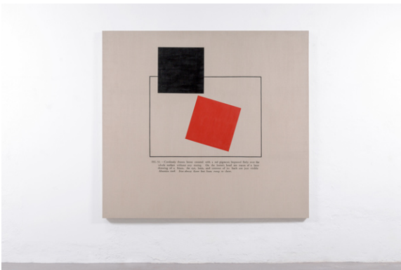
Jose Dávila, Untitled , 2015. Acrylic and vinyl paint on loomstate linen, 200 x 220 cm.

“The idea,” he relates, “is that the pieces should present themselves in different contexts. Then, after eight months, they return and form the cube again. The cube will say something about how LA as a city is made up of many mini-cities.”