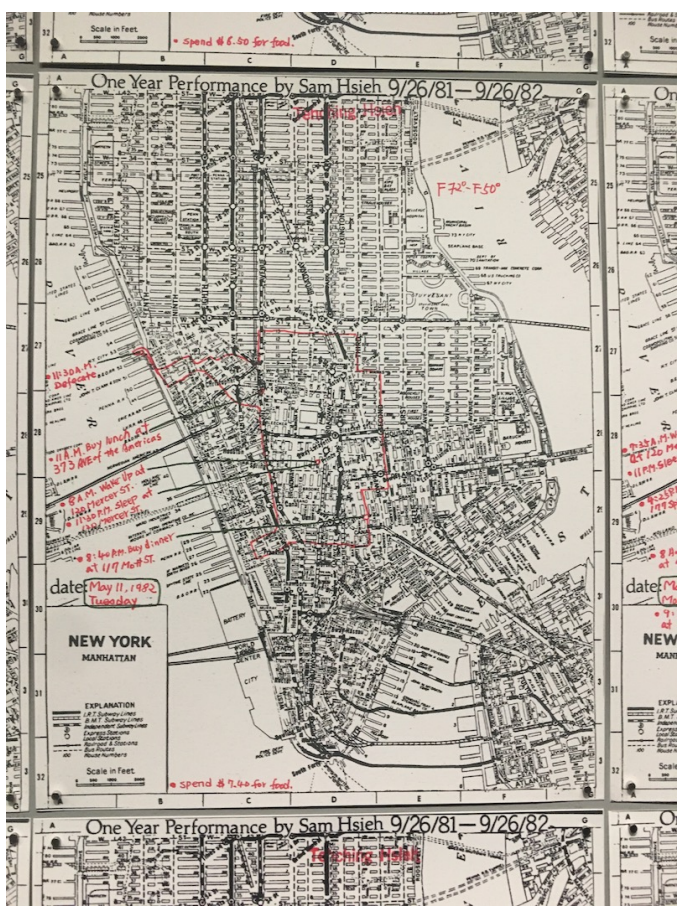
The map for May 11, 1982 of One Year Performance 1981–1982 (Outdoor Piece) . ARTNEWS

The map for May 11, 1982, exactly 35 years years ago today, reveals that he spent the day in Downtown Manhattan. He woke up at 8 a.m. at 120 Mercer Street in SoHo, bought lunch at 11 a.m. at 373 Avenue of the Americas in the West Village (the address is now home to a nail salon and spa), purchased dinner at 8:40 p.m. at 117 Mott Street in Chinatown (now a realty office), and then went to sleep at 11:30 p.m. back at 120 Mercer (now the back of the Hugo Boss store on Broadway).