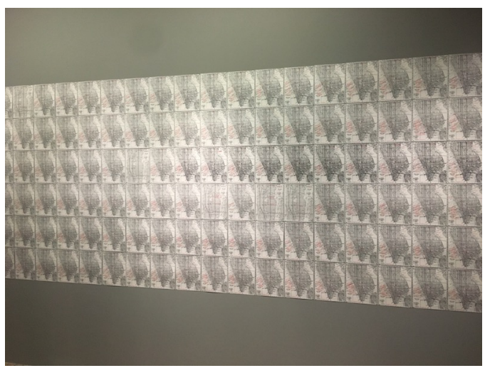
Documentation of One Year Performance 1981–1982 (Outdoor Piece)

The map for May 11, 1982, exactly 35 years years ago today, reveals that he spent the day in Downtown Manhattan. He woke up at 8 a.m. at 120 Mercer Street in SoHo, bought lunch at 11 a.m. at 373 Avenue of the Americas in the West Village (the address is now home to a nail salon and spa), purchased dinner at 8:40 p.m. at 117 Mott Street in Chinatown (now a realty office), and then went to sleep at 11:30 p.m. back at 120 Mercer (now the back of the Hugo Boss store on Broadway).