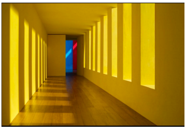
James Casebere. Vestibule, 2016. framed archival pigment print mounted to dibond paper: 62 x 44 3/8 inches (157.5 x 112.7 cm). framed: 64 11/16 x 47 1/16 x 2 1/4 inches (164.3 x 119.8 x 5.7 cm.). edition of 5 with 2 APs

Well, I'm going to Mexico in a couple of weeks to actually visit the Barragán houses and studio for the first time. That's the next step. And I'm going to keep following this trail. One of the dangers of doing a show now is that you stop working. I felt like I was on quite a roll in the studio; I wanted to just keep it up. So ideally I'm just going to get back to it and keep working on more images, approaching it in a similar way to how I did at the beginning, which was really more intuitively, and just one image at a time without the notion that this would become a compact, complete project all about Luis Barragán. We'll see where it leads.