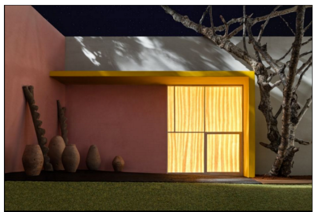
James Casebere. Yellow Overhang with Patio, 2016. framed archival pigment print mounted to dibond paper: 44 3/8 x 66 1/2 inches (112.7 x 168.9 cm). framed: 47 x 69 3/16 inches (119.4 x 175.7 cm). edition of 5 with 2 APs