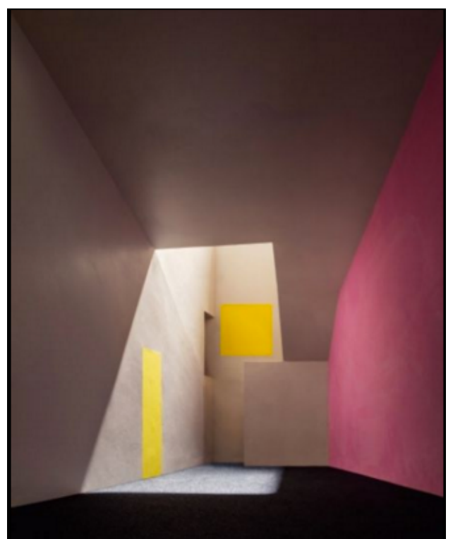
James Casebere. Vestibule, 2016. framed archival pigment print mounted to dibond paper: 62 x 44 3/8 inches (157.5 x 112.7 cm). framed: 64 11/16 x 47 1/16 x 2 1/4 inches (164.3 x 119.8 x 5.7 cm.). edition of 5 with 2 APs