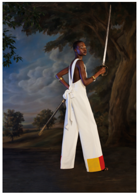
Harbison jumpsuit, Chelsea Paris shoes