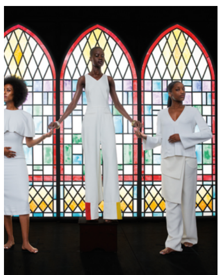
Left to right; Cushnie Et Ochs dress, Harbison jumpsuit, Chelsea Paris shoes, Cushnie Et Ochs top, Off White pants