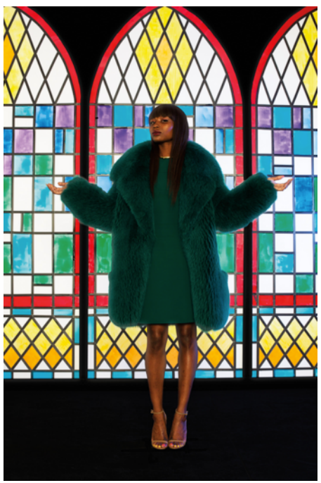
Cushnie Et Ochs fur coat and dress, Ade Samuel shoes, Khiry Collection necklace