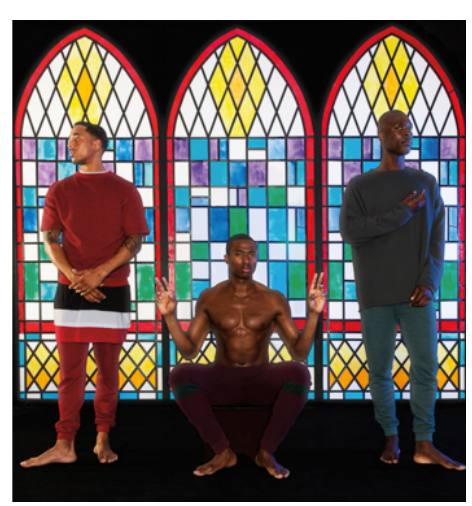
Left to right; Karl Kani top and pants, Casely-Hayford shirt, Pyer Moss pants, Yeezy season 1 top, Karl Kani pants