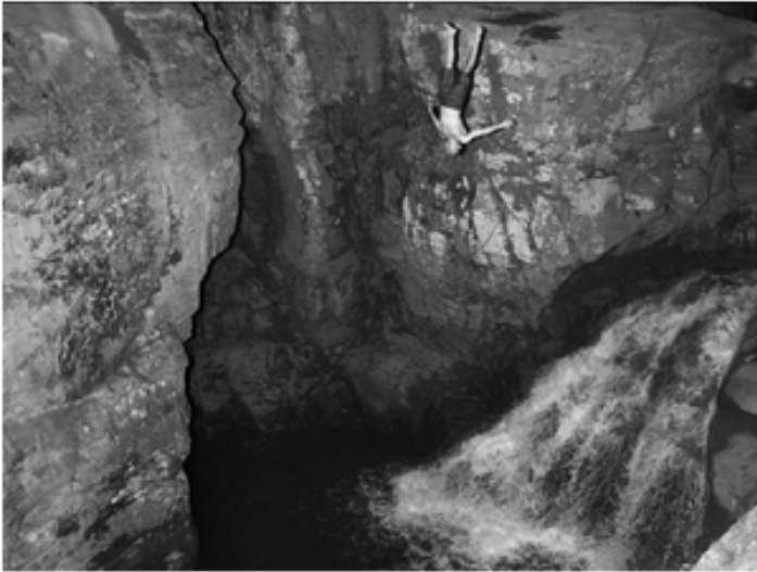
Alec Soth, "Near Kaaterskill Falls, New York" (2012). Archival pigment print mounted to Dibond.

Rail: Let's transition a bit and talk about Songbook . It seems to me very much connected to your previous body of work, Broken Manual (2010), insofar as the two projects have a kind of yin-yang relationship. Manual was about a desire to escape, and you were traveling mostly solo, whereas Songbook is more about a longing for community and you worked with a collaborator.