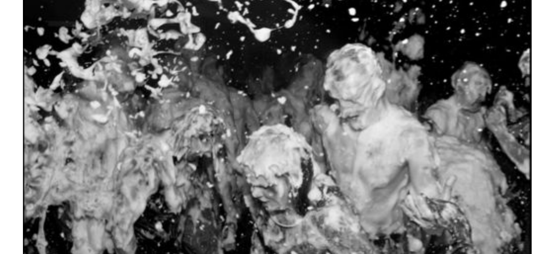
"Crazy Legs Saloon, Watertown, New York," 2012.