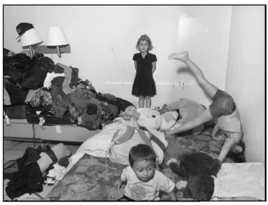
"Home Suit Home, Kissimmee, Florida," 2012.

An exhibition of more than 25 new images, as well a few issues of The LBM Dispatch , is currently on display at Sean Kelly gallery in New York. Beginning today, Soth is also taking over the gallery's Instagram account. "Songbook" will open at Fraenkel Gallery in San Francisco on February 5, and in Soth's hometown of Minneapolis at Weinstein Gallery on February 20. The first edition of Songbook (MACK, 2015) is sold out but a second edition is expected in March 2015.