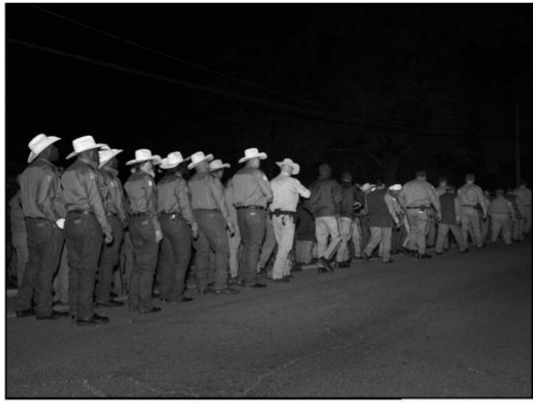
{\rm ``Execution, Huntsville Prison, Huntsville, Texas, "2013. \, \\ {\rm } \\