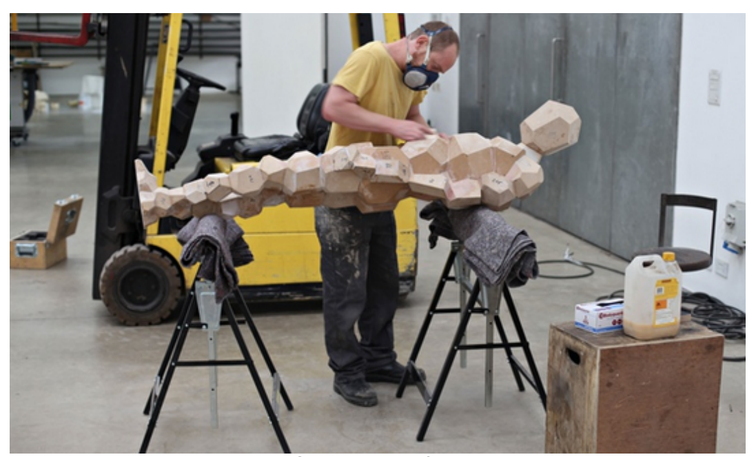
Work in progress on Land, Antony Gormley's work for the Landmark Trust.

Life-sized iron figures will be installed at five waterside sites including charity's buildings in Suffolk and Bristol Channel