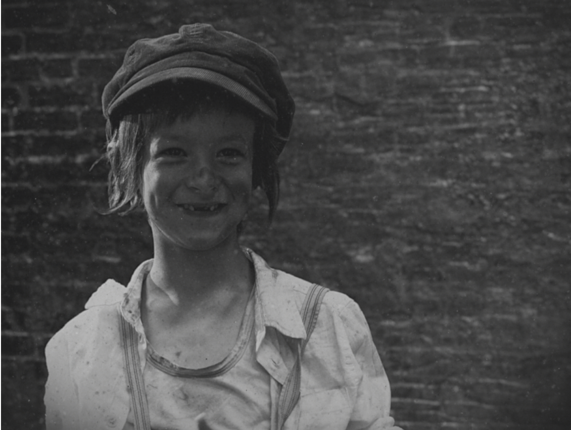
David Claerbout, Still from The Close , 2022, Single channel video projection, black & white, 6 channel surround sound, 15 min, 21 sec. © David Claerbout, Courtesy of the artist and Sean Kelly, New York

One of the films, entitled The Close (2022), serves as an ode to past eras and the developments of technology. Today, the camera and technology do not hold the same value that they did in the 1920s. The evolution shown in Claerbout's physical film is representative of these meanings that society held for a medium like photography. The excitement and candidness of the personalities in the film are poetic and nostalgic of a time unknown to many. We take advancements in technology for granted; photography is something we interact with on a daily basis, and even art is a delight that is easily available to us with the tap of a screen. The images in Claerbout's film are humbling; we remember there was a time before us when technology was not accessible to everyone, and only the lucky were able to see their likeness printed. The artist recreates a time when photography was reason enough to laugh and appreciate the enchanting powers of a camera. Each drawn representation adds to the ambiance of mere innocence reflected through the images. Through music and clear representations of working-class people shown in the film, Claerbout creates an emotional and insightful collection of images that enlighten the audience about the historical role of the camera in the development of social agency. His use of costuming, visual effects, and musical additions serve the narrative