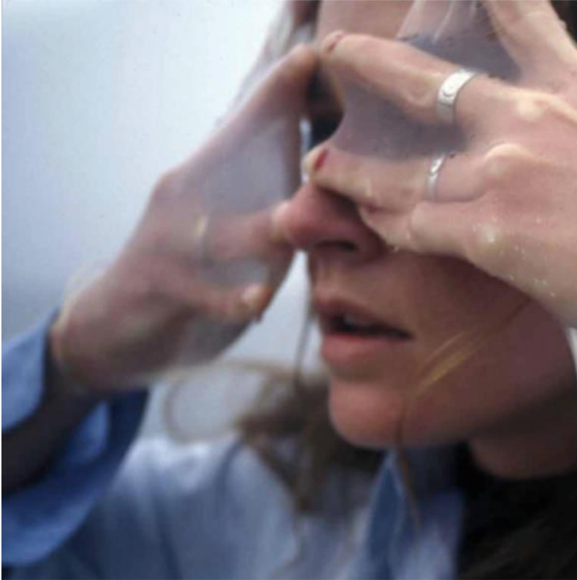
"Long Island", from the series He Drowned in Her Eyes as She Called , 1999, 31x46", Cibachrome

They were working in a panel with a colorful plaster. It was very dense, yet malleable. Seemed to be a wide coast-line, amongst certain atmospheric conditions where there is a tension between the gestural experience and higher sensitivity to heights and depths that converts vision into a less compelling sense. She explains that it is therapeutic only as a way to transform traumatizing falls into a process of topographical remodeling in a purely recreational practice.