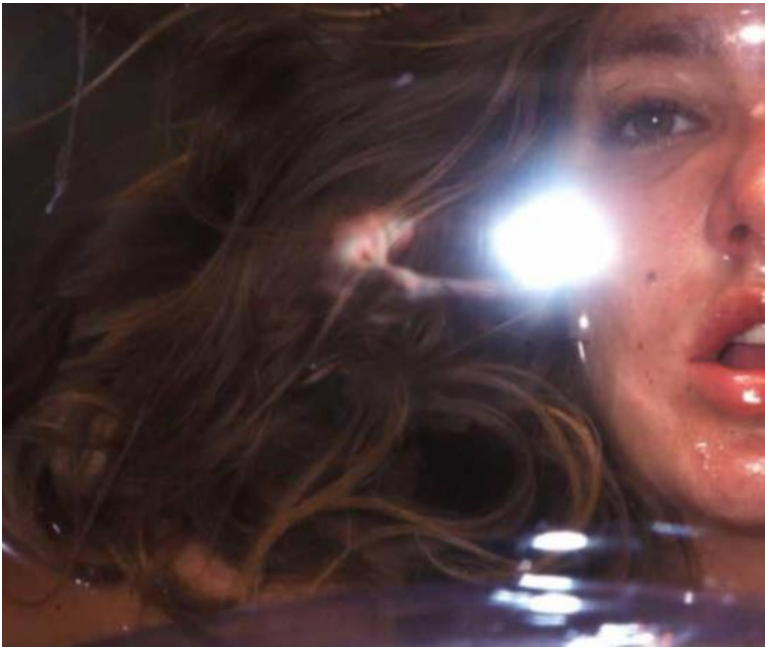
"Medusa" from the series He Drowned in Her Eyes as She Called, 1999. 40 x 65", Cibachrome.

"Nah, forget it, isn't not necessary". Really. They hadn't boarded for that and the situation could get even worse. Exactly the same path, when he identifies the weapon first, magically floating, and following the rope was the fish itself, kind of turned: a hidden angel shark, really big. He would go up to the boat and call the son of the coxswain, a boy who always helped him: "go there, it's under the boat. The weapon is loose, a little above. You can reach it easily. Get it, release the rope and pull it up." The new pictures, in color, about 120 pound, twice the size of the boy, everybody helped.