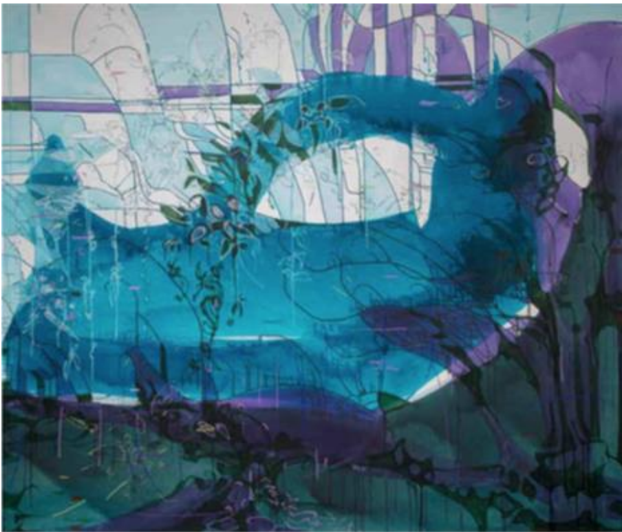
Figure 1(Top) "Afternoon", Mixed Media on Canvas 2015, 80 x 95" Courtesy of the artist and Galeria Fortes Vilaca (Bottom) "Schatten Gerwasche",. Mixed Media on Canvas 2015, 80 x 95", Courtesy of the artist and Galeria Fortes Vilaca