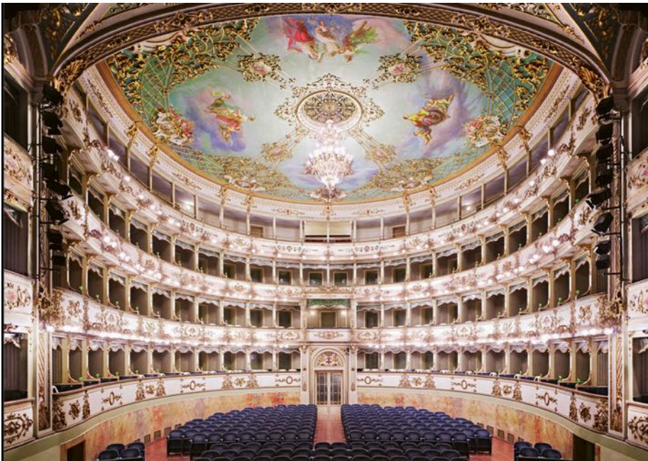
Teatro Comunale di Carpi | 2011. Courtesy of Ben Brown Fine Arts ©2013 Candida Höfer, VG Bild-Kunst