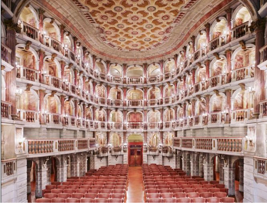
Teatro Scientifico Bibiena Mantova | 2010.