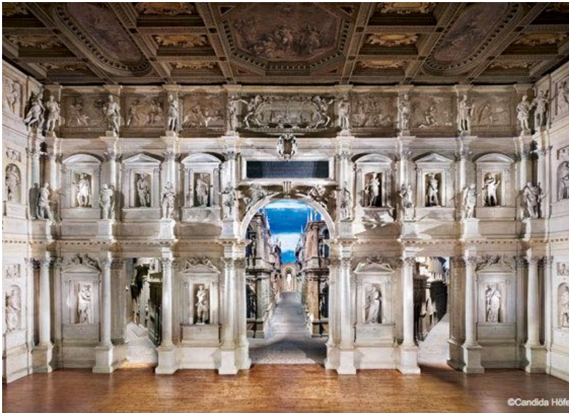
Teatro Olimpico Vicenza II, 2010, 180 x 235cm

In a new exhibition by the leading German photographer Candida Höfer, her cool, objective view reveals the inner drama of some of the most spectacular buildings of the Italian Renaissance