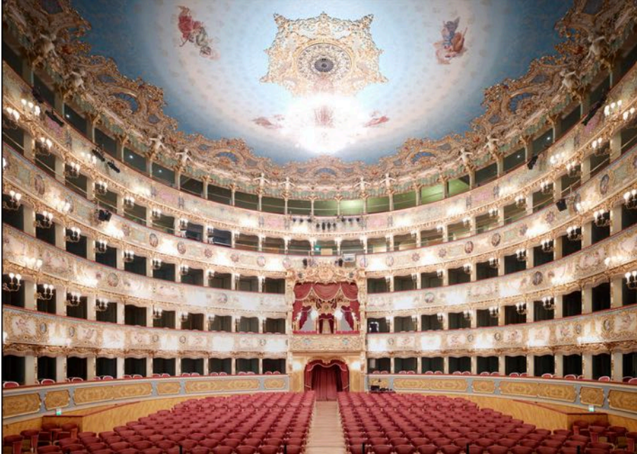
Teatro La Fenice Di Venezia V 2011. Courtesy of Ben Brown Fine Arts ©2013 Candida Höfer, VG Bild-Kunst