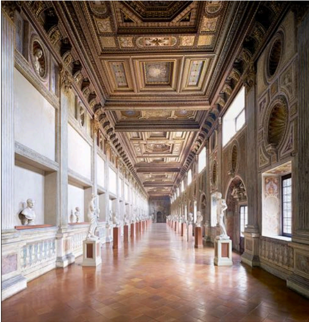
Palazzo Ducale Mantova V 2011, 180 x 176cm. Courtesy of Ben Brown Fine Arts ©2013 Candida Höfer, VG Bild-Kunst