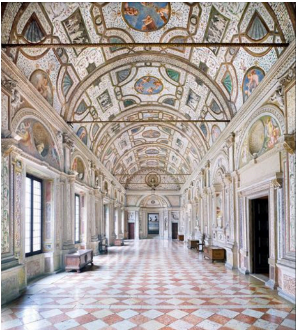
Palazzo Ducale Mantova IV Palazzo Ducale Mantova IV 2011, 180 x 176cm. Courtesy of Ben Brown Fine Arts ©2013 Candida Höfer, VG Bild-Kunst