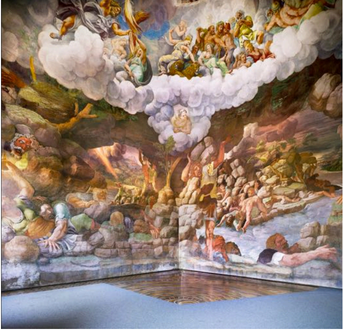
Museo Civico Di Palazzo Te Mantova IV 2010, 180 x 187cm. Courtesy of Ben Brown Fine Arts ©2013 Candida Höfer, VG Bild-Kunst