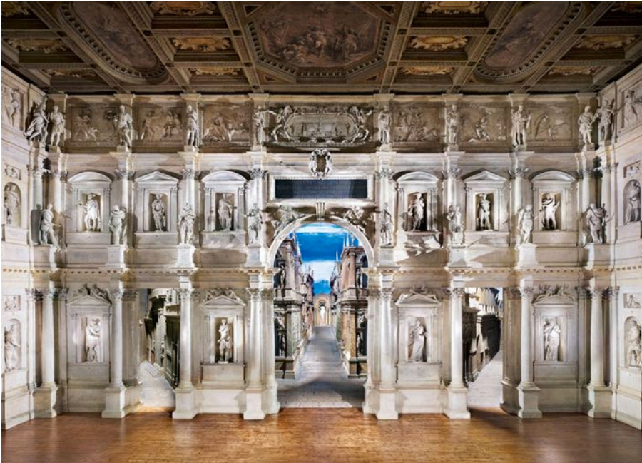
Teatro Olimpico Vicenza II 2010, 180 x 235cm. Courtesy of Ben Brown Fine Arts ©2013 Candida Höfer, VG Bild-Kunst