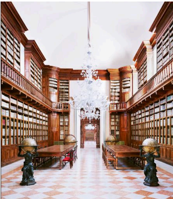
Biblioteca Teresiana Mantova I 2010.