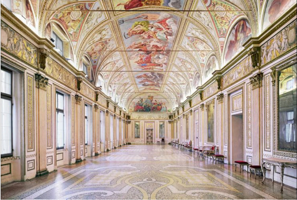
Palazzo Ducale Mantova I Palazzo Ducale Mantova I 2011. Courtesy of Ben Brown Fine Arts ©2013 Candida Höfer, VG Bild-Kunst