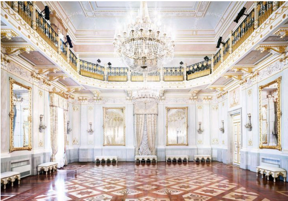
Teatro La Fenice di Venezia III 2011, 180 x 242cm. Courtesy of Ben Brown Fine Arts ©2013 Candida Höfer, VG Bild-Kunst