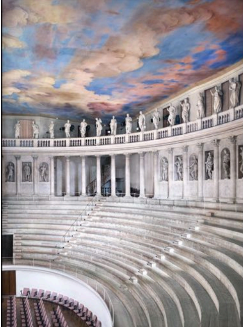
Teatro Olimpico Vicenza III 2010, 180 x 144cm. Courtesy of Ben Brown Fine Arts ©2013 Candida Höfer, VG Bild-Kunst