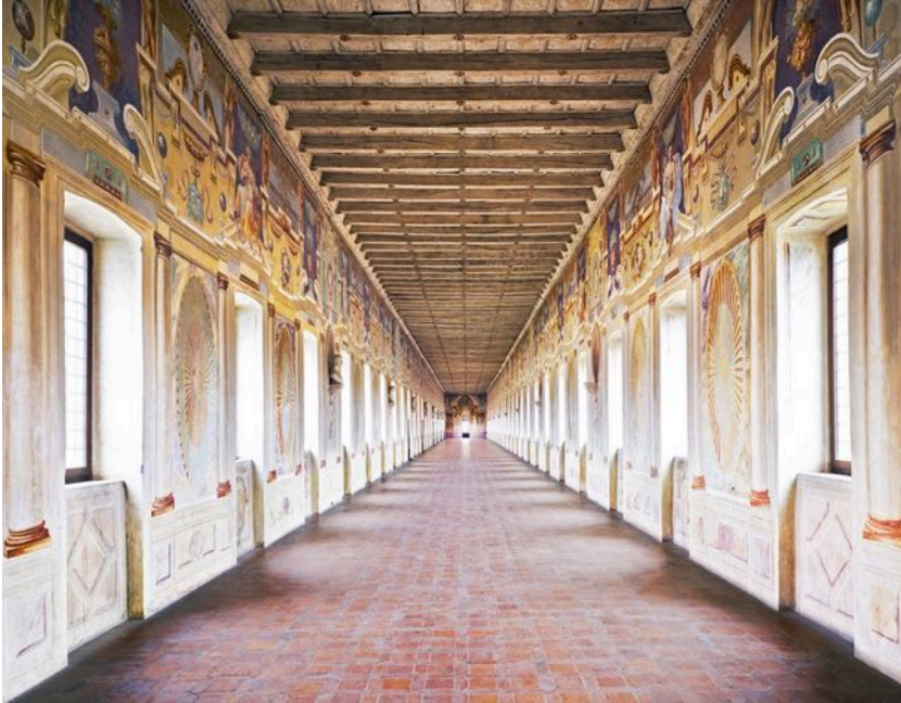
Galleria Degli Antichi Sabbioneta I 2010, 180 x 220.7cm. Courtesy of Ben Brown Fine Arts ©2013 Candida Höfer, VG Bild-Kunst